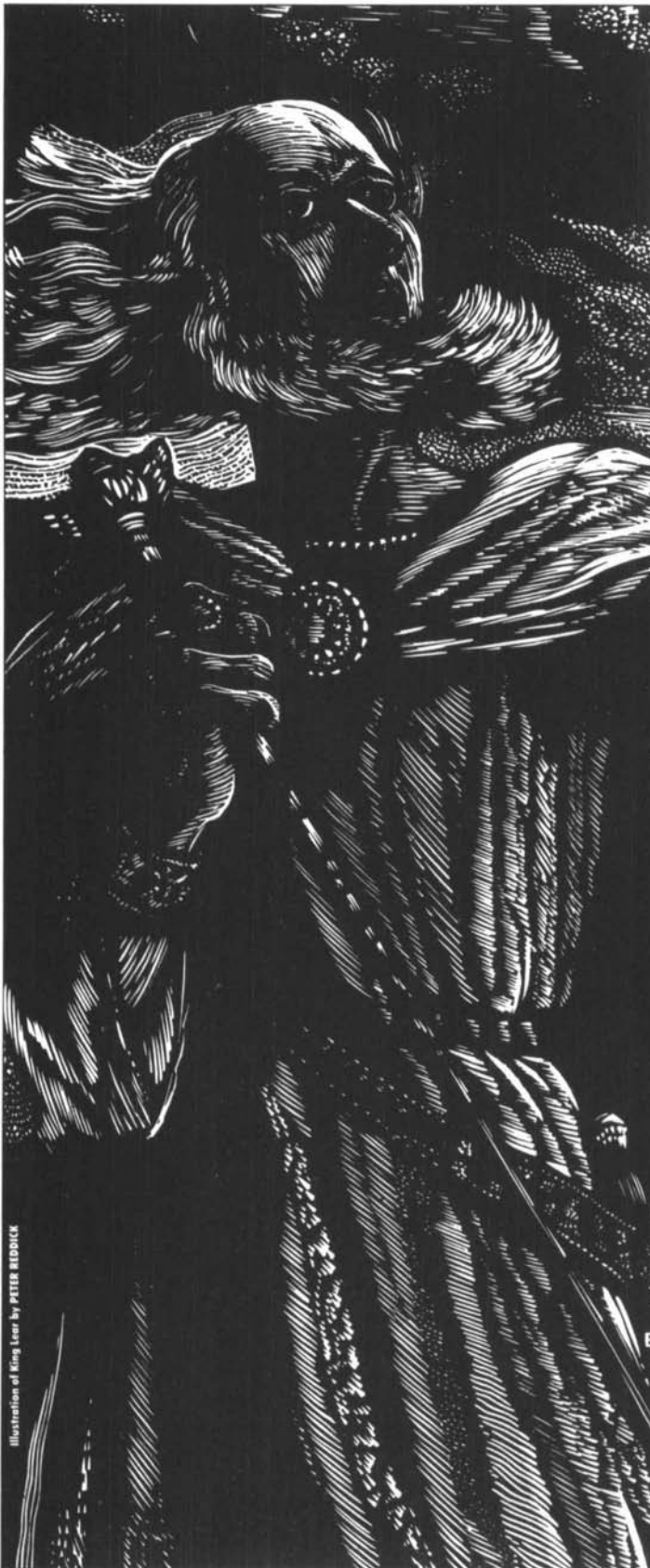
Illustration of King Lear by PETER REDDICK