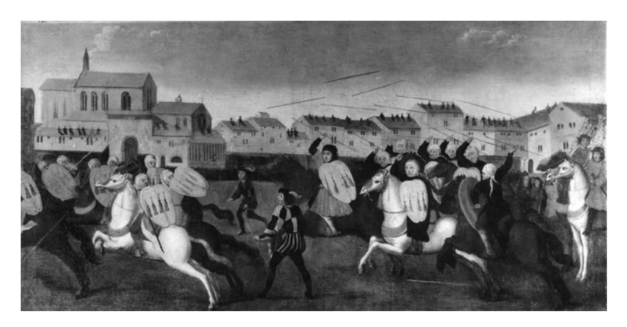
Figure 4. Juego de cañas in Valladolid, on the occasion of Philip the Handsome's visit to Castile. Unknown artist, first half of the sixteenth century.

Although the cane game was perhaps specifically planned for and by Iberian nobles, most other events were designed to enhance participation of nobles from diverse backgrounds. To this end, for five events (appendix 1, nos. 2, 5, 6, 12, and 13) regulations were described and published on posters, one even proclaimed by a king of arms. 117 In all these five events the principal organizers are described as mantenedores—that is, persons who maintain or hold the lists against any challengers, called aventureros. 118 The challengers could engage in a combat by touching the shield of one of the mantenedores or touching the plume worn by a certain lady. 119 Most of the regulations were concerned with the way the combats were to be conducted—e.g., how many courses the combatants would run and the conditions for obtaining a prize, which could entail the number of lances broken, but also having the most gallant appearance or simply being the best jouster. 120 These regulations not only helped to create a level playing field for knights familiar with different jousting traditions and to avoid accidents in the lists, but also to encourage the participants to do their best to obtain prizes and honor. Indeed, the prize ceremonies served to distinguish individual knights who could act as examples for the rest. Many