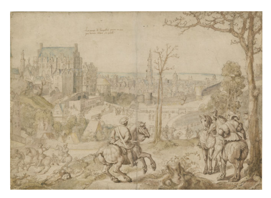
Figure 2. View of the Coudenberg Palace in Brussels with the jousting field and park, ca. 1531–33. Drawing for a tapestry, ascribed to Bernard van Orley. © Leiden, Universiteitsbibliotheek PK-T-2047 (CC BY 4.0).

The choice of cities in Brabant and Hainaut to host the tournaments can thus be attributed to both the political importance of the residences and the available infrastructure that could easily be adapted for putting on the events. That said, only five of the fourteen chivalric events were staged in the courtyards or gardens of princely residences, whereas seven took place in the main squares of the towns of Brussels, Ghent, Binche, and Antwerp (see appendix 1 and fig. 1). Another two events were mounted outside the city walls but were accessible to the general public. It is clear that even the spectacle in Mariemont was more of a public than a purely courtly spectacle, since Calvete de Estrella remarks that "the roads and fields [to Mariemont] were crowded with people . . . not only from Binche but also from all other neighboring places." Grapheus mentions that for the Antwerp tournament of 15 September 1549 a double barrier was constructed to protect the tourneyers "against the hustle of the crowds." The city dwellers—especially the urban elites and higher middle classes of the town—were an ideal target for the prince: they could watch the events and sometimes even participate in them,