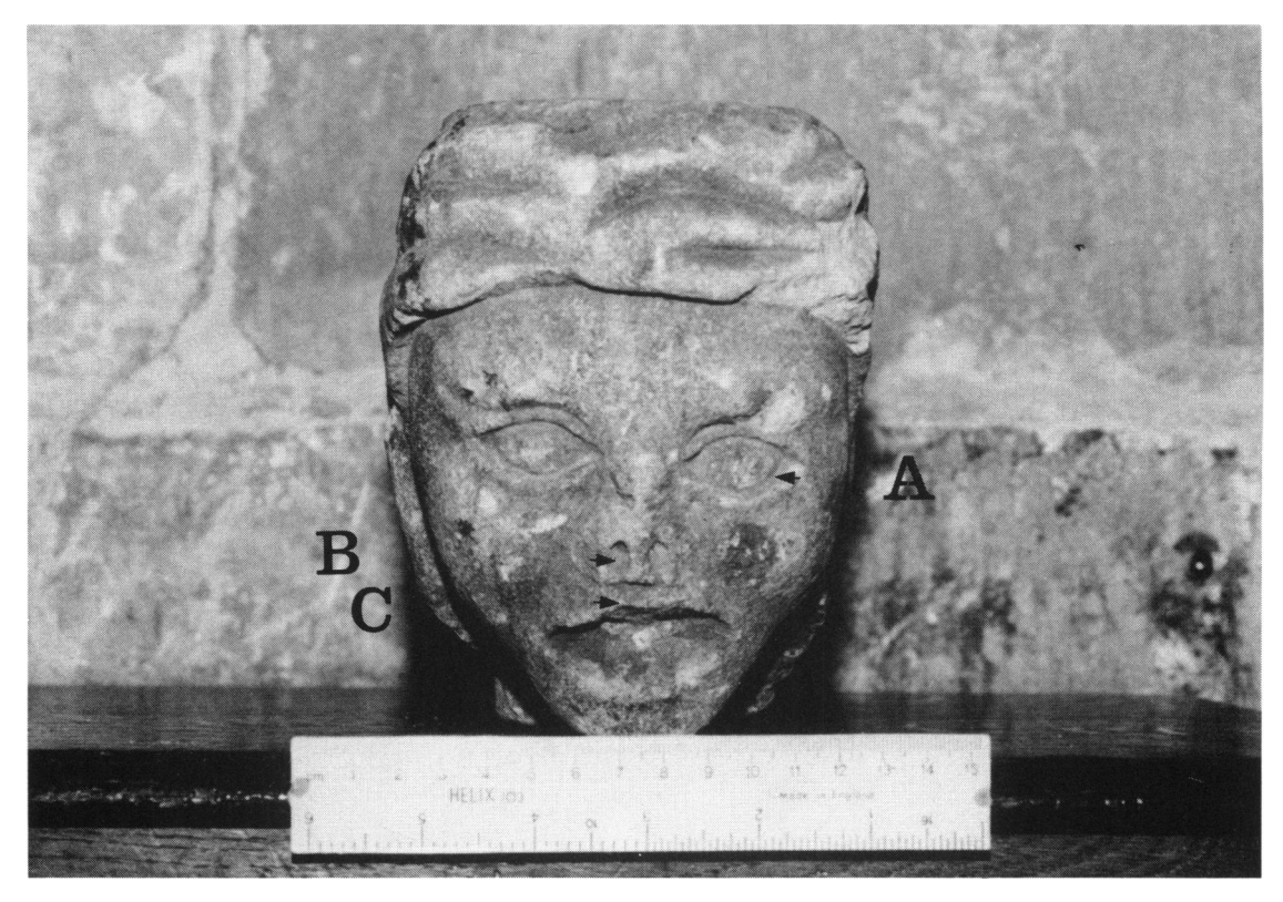
Plate 1. Leper head sculpture, anterior aspect. A : everted lower eyelid, suggestive of lagopthalmos. B : nasal orifices accentuated. C : withdrawal of upper lip.