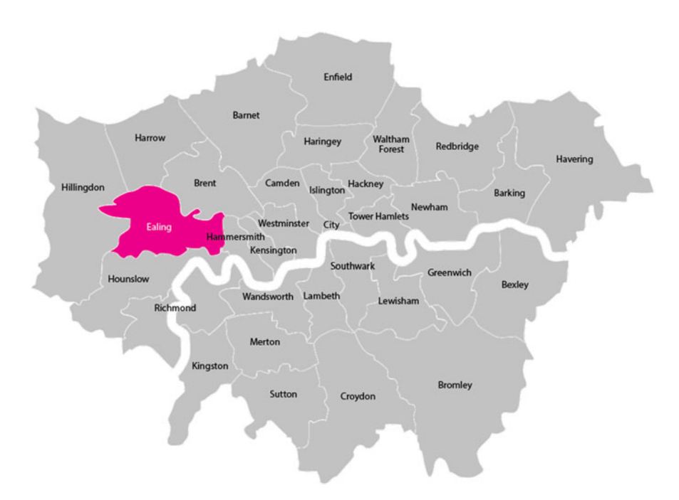
Figure 1. Map of London with the borough of Ealing highlighted in pink (www.londoncouncils. gov.uk/node/30047)