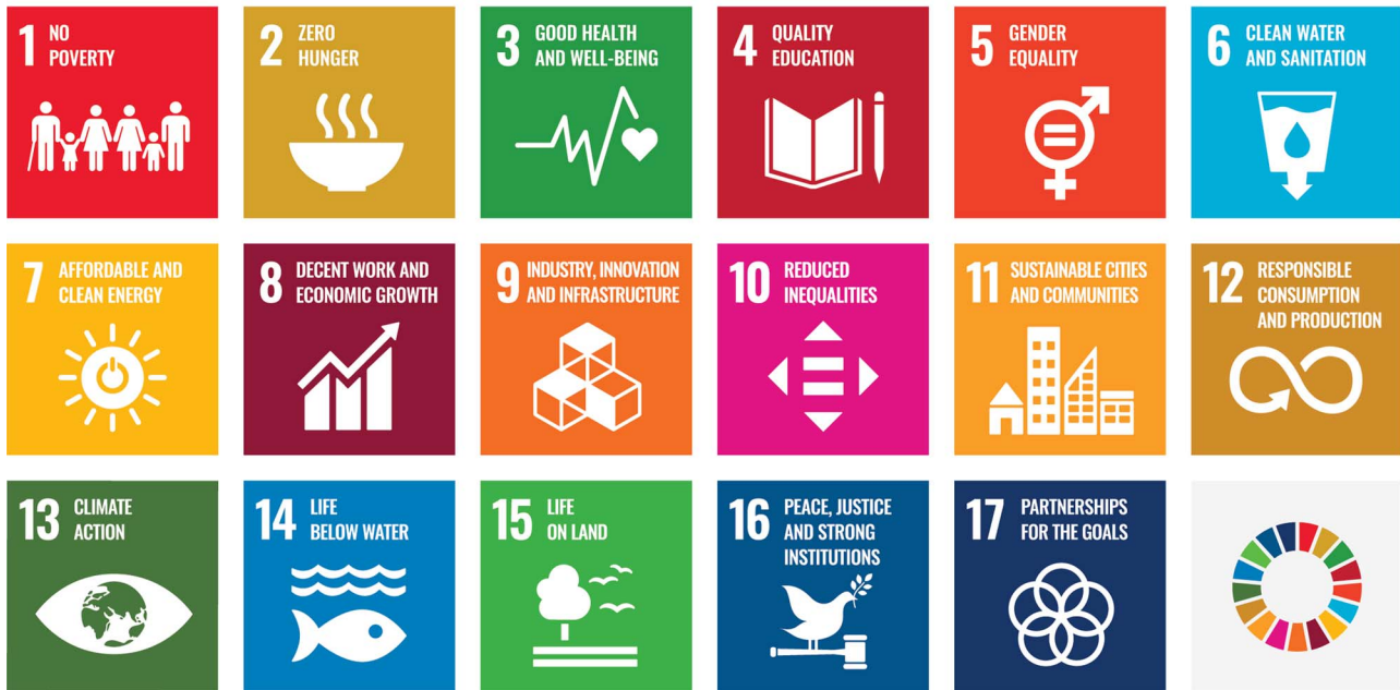
FIGURE 6. UN Sustainable Development Goals.

required to obtain host-government approval and to secure financing. These studies go by various names, including environmental assessment, ESIA, and environmental, social, and health impact assessment (see Noble 2015). For these studies, heritage practitioners are retained to provide cultural-resources input as part of a larger team composed of environmental and social SMEs.