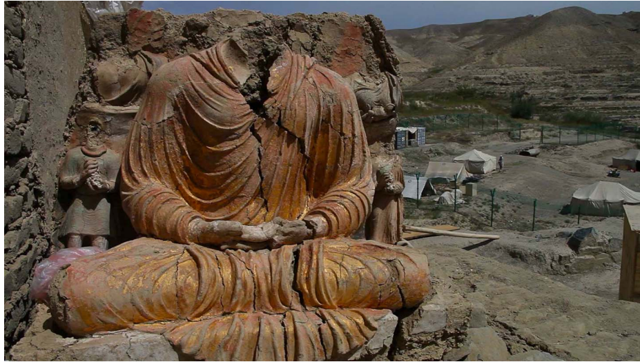
FIGURE 4. Seated Buddha at Mes Aynak, Afghanistan.