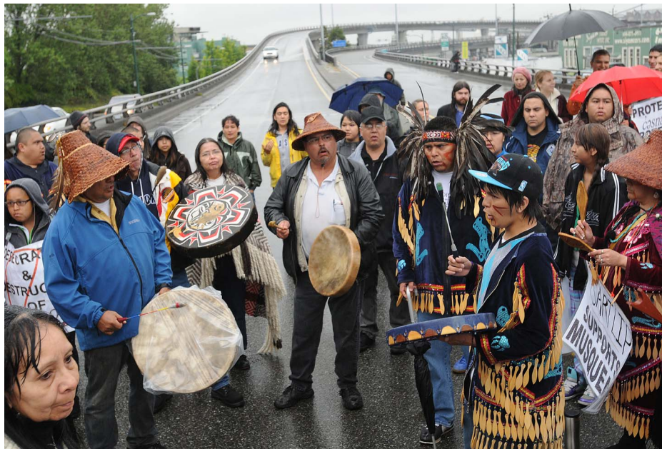
FIGURE 5. Marpole midden development protest, Vancouver, Canada.

sustainable-finance/lending-key evaluation checklist. According to the checklist, Chinese banks working overseas are required to align their lending practices with relevant international guidelines and to meet industry best practices. International guidelines include the Equator Principles (see below), UN Global Compact (2014), UN Financial Initiative, and the UN Environment Programme Statement of Commitment by Financial Institutions on Sustainable Development (UNEP 1997). Furthermore, banks are obliged to consult with relevant regulatory agencies and engage qualified and independent third-party consultants to undertake a due diligence review of project environmental and social risks. Chinese banks must implement this checklist in their day-to-day