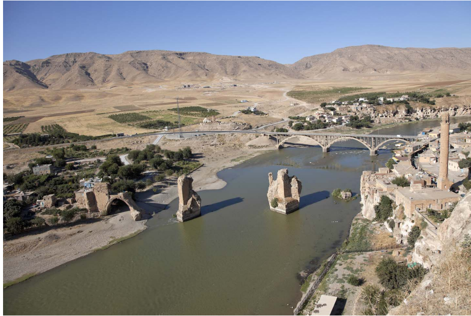
FIGURE 2. Hasankeyf, Turkey.

from the World Bank Group’s International Centre for Settlement of Investment Disputes. The property was put forward for inscription on the World Heritage List in 2018 but was subsequently referred back to the Romanian government (at the government’s request) until the international arbitration matter is solved (UNESCO 2018a). At the time of writing, the proceeding is ongoing (ICSID 2019).