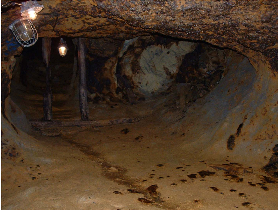
FIGURE 3. Roman mining gallery in Roșia Montană, Romania.