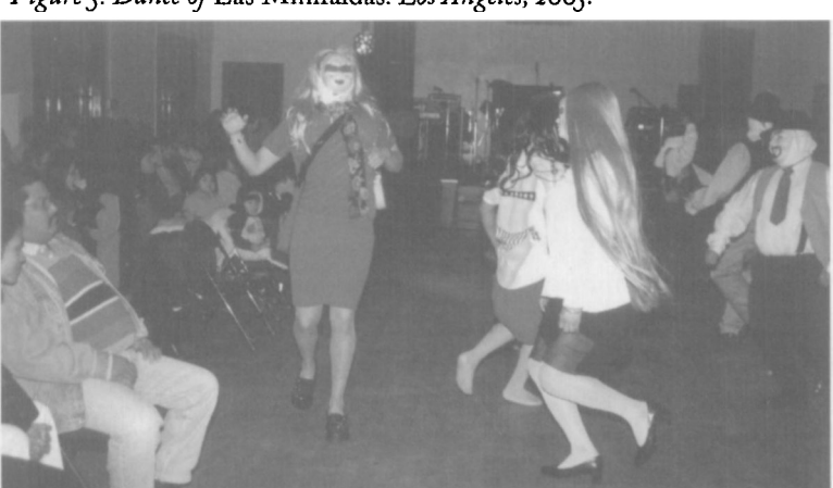
Figure 3. Dance of Las Minifaldas. Los Angeles, 2003.

In the case of the immigrant male dancers, certainly the miniskirts do not represent sexual and family liberation. However, they similarly refer to men's assimilation urban ways of life and changes in their gender values, roles, and ideology. What we see in the dance is the substitution of rural peasant ways of dressing with urban dress styles. Immigrant men are portrayed as wearing sunglasses, ties, vests, and pants made of cashmere—all considered accessories of city life. More specifically, "Las Minifaldas" refers back to the new gender roles, values, and social norms that regulate immigrants' gender behaviors