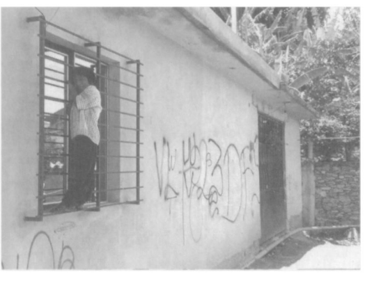
Figure 2. This graffiti marks a territorial boundary of the gang 23 West in Yalálag.

common complaint he receives from the students' parents is the selling of drugs after school. One of the teachers also mentioned that he has started to talk about the consequences of taking drugs because some of his students are becoming drug consumers. Another teacher described what the cholos actually do after school: