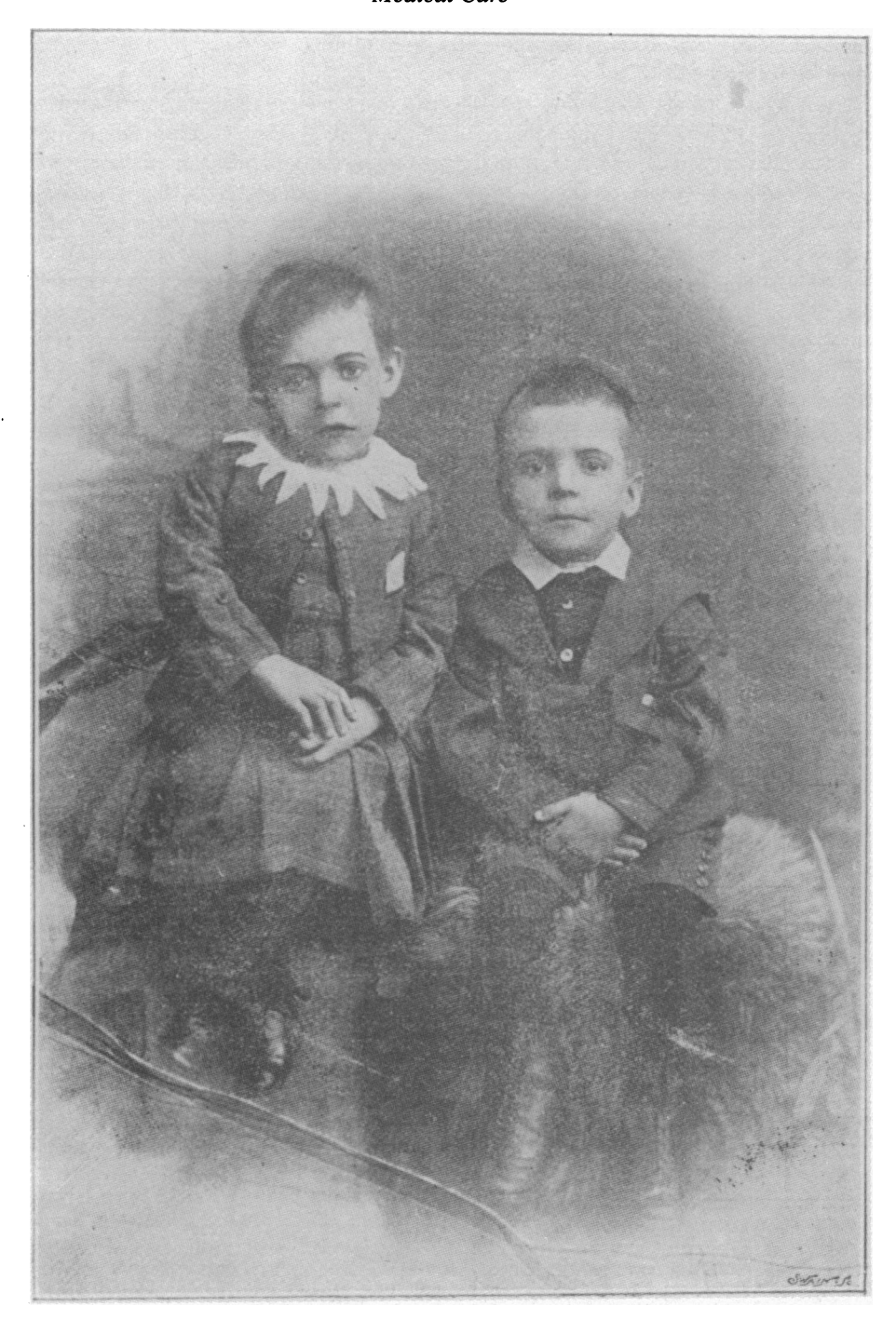
Figure 5: Two brothers after less than one year of thyroid gland therapy. (From British Medical Journal, i (1894): 1179.)