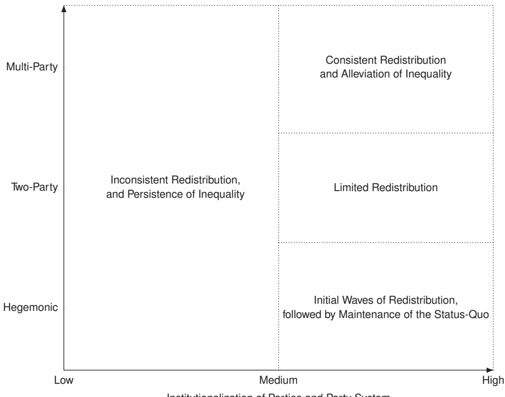
Institutionalization of Parties and Party System