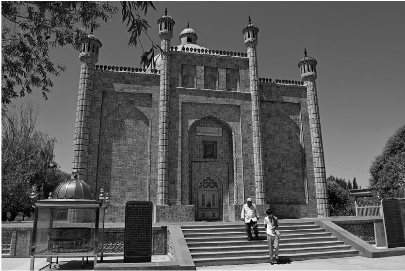
Figure 1.2 The shrine of Satuq Bughra Khan, Atush (Xinjiang, China).

This applied in historical terms, as “the first place among the earliest Muhammadan mystics” was given to a woman, Rabi’a al ‘Adawiyah of Basra (born ca. 717); 20 Rabi’a was credited with miracles and – possibly more importantly – with transforming “somber ascetism into genuine love mysticism,” to borrow from Annemarie Schimmel. After centuries of practicing ascetism, being disciples of great masters, and participating (sometimes leading) community gatherings of dhikr (“remembrance” of God), by the twelfth century women disciples and their male masters were compelled to explore new ways to properly and “legally” pursue initiation ceremonies in their tariqas without any direct touching. 21 But by the fourteenth century social norms of segregation had taken over in the institutionalized mystic orders.