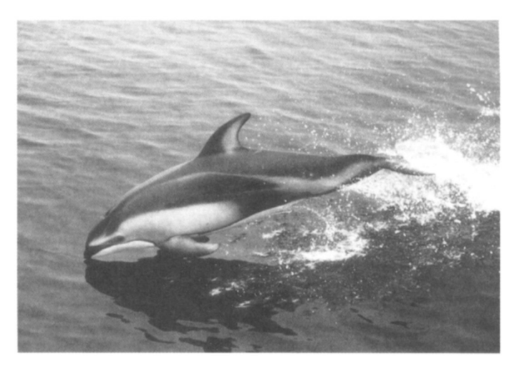
Pacific white-sided dolphin Lagenorhynchus obliquidens . Oceanic Society Expeditions offers opportunties to study these and other cetaceans ( Nancy Black ).

Operation Raleigh offers scientists an economical and relatively trouble-free means of conducting overseas field research. Raleigh provides full logistical support including food and internal travel, highly motivated teams of volunteers (aged 17–25 years), opportunities to conduct follow-up work