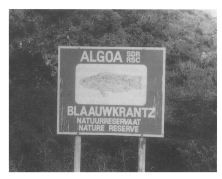
Notice declaring a fish reserve in South Africa, believed to be the first anywhere for a member of the Anabantidae.

South Africa has established the Richtersveld National Park in Cape Province. It took 18 years to complete negotiations to protect the 1624-sq-km area, which is renowned for its