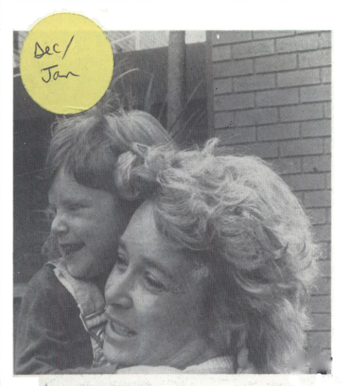
Family Support Conference Report