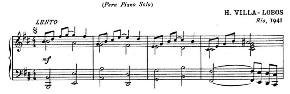
Example 1 Heitor Villa-Lobos, Bachianas brasileiras no. 4 (1941), 'Prelúdio (Introdução)', bb. 1-4.