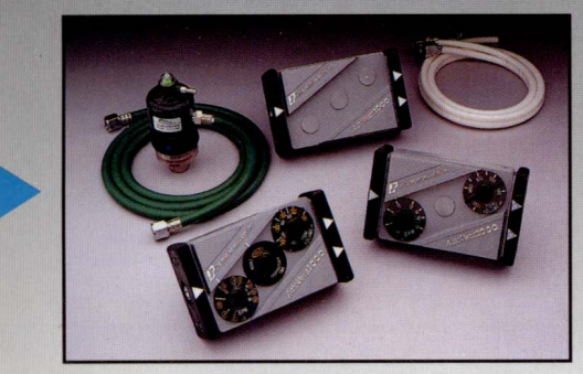
The LSPI AutoVent Series.