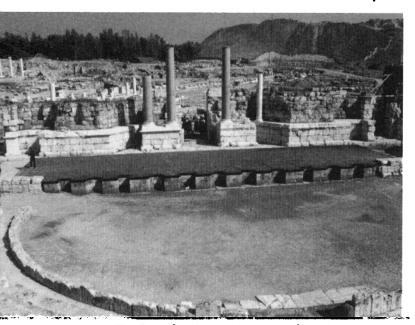
Tel Beit She'an is the site of the bestpreserved Roman amphitheatre in Israel, which once seated 6,000 spectators.

"In 4,000-year-old Jerusalem the past and present of the country caught up with us... the narrow Arab alleyways and new Jewish quarter to the Wailing Wall and the the Church of the Holy