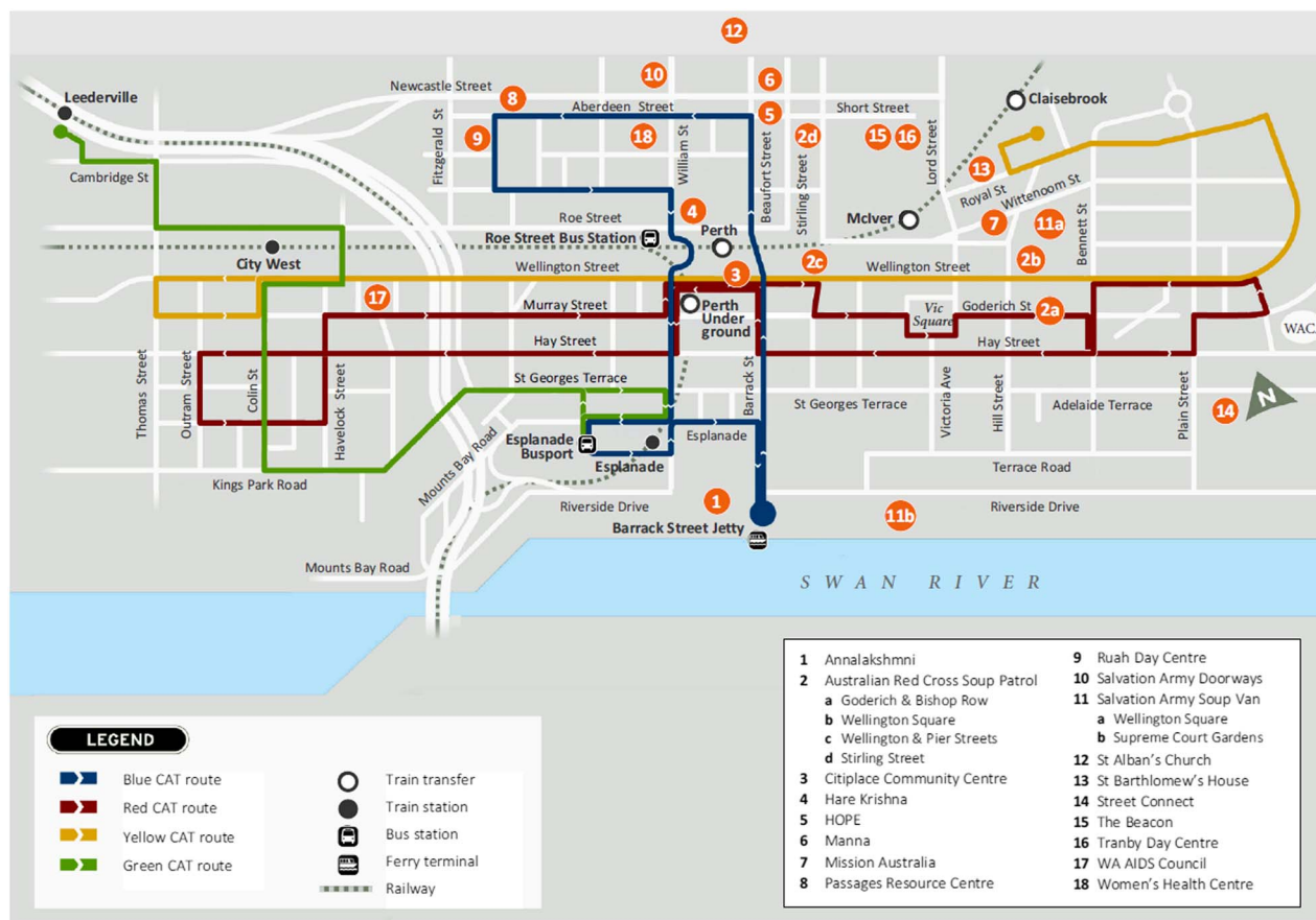
Fig. 1 Map of charitable food services in inner-city Perth, Western Australia, after disclosure of service locations used by interviewees, February 2016