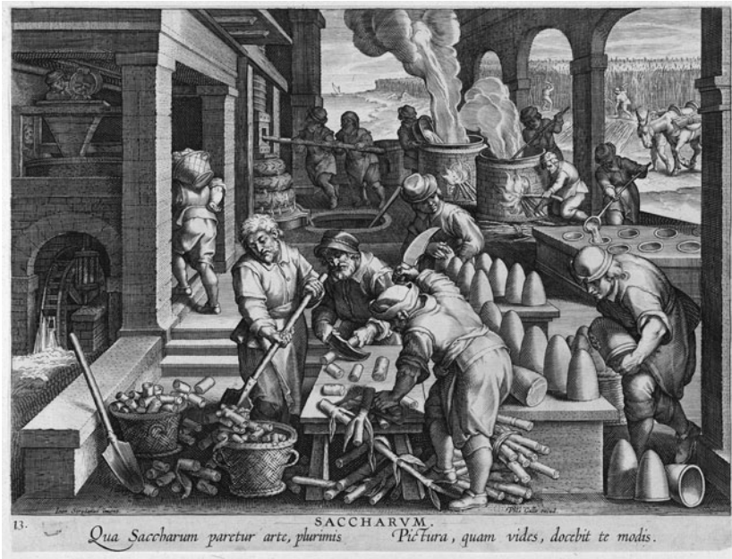
Figure 4 Sugar mill, by Jan van der Straet (second half of the 16th century) (Van der Straet 1600, plate 13).

wheel or an Archimedean screw (Cosgrove 1990, 45–49). This principle of circularity could produce convivial tools, such as, arguably, the successful balancing of the actions and affordances of rivers, farmers, sediment, ships and tidal currents. As the sugar plantations of medieval Cyprus demonstrate, other products of this principle were distinctly unconvivial.