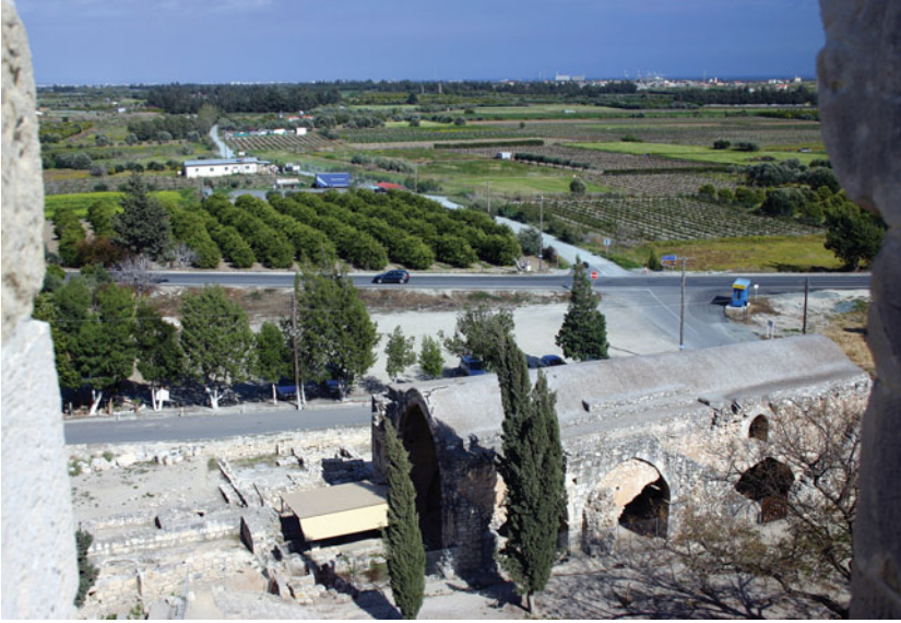
Figure 5 View south from the restored battlements of Kolossi Castle, looking over the vaulted sugar refinery (Michael Given). (Colour online)

the kidnapping of their own workers and serfs in Episkopi (Luttrell 1996, 167; Ouerfelli 2008, 124).