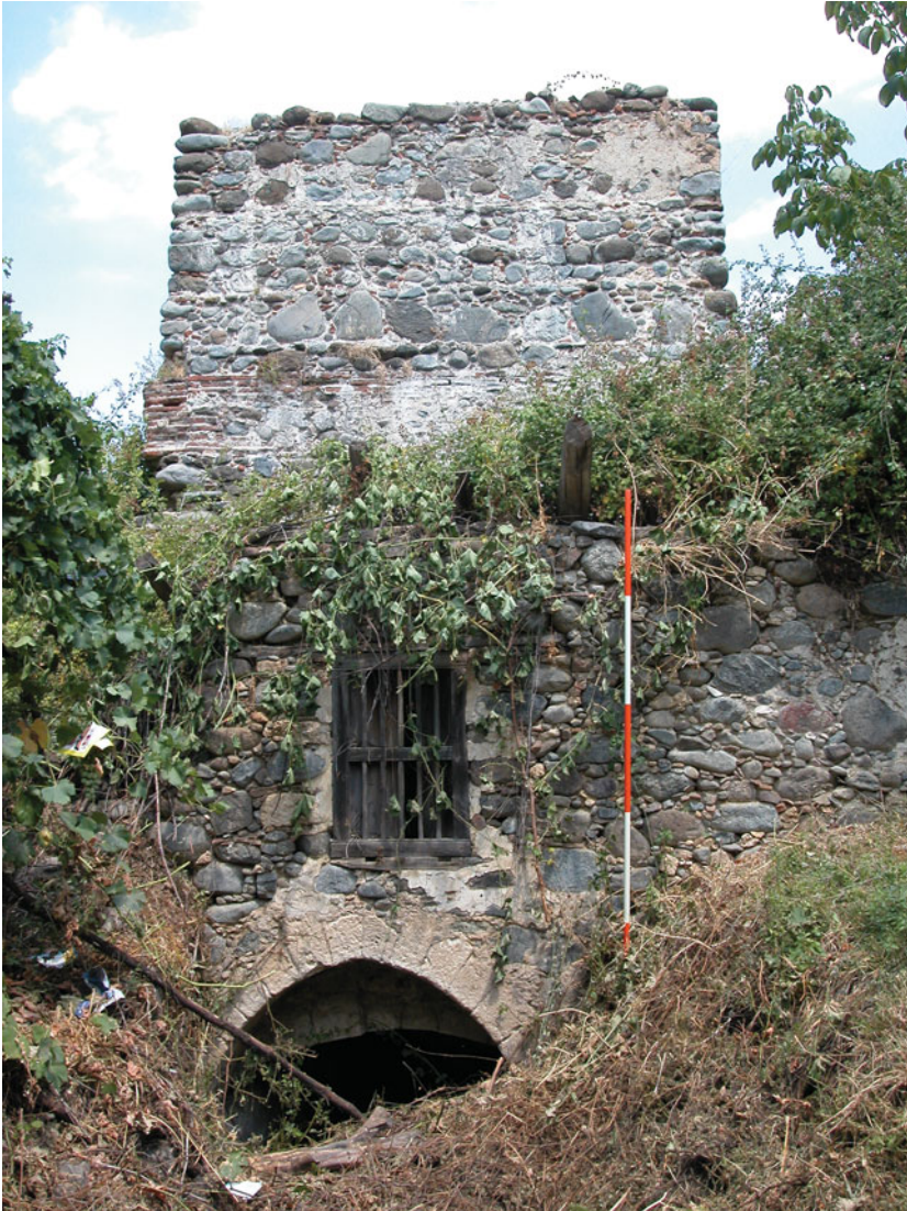
Figure 7 Lachistos mill: penstock (above), milling room (with window) and turbine room (with arch) (Chris Parks). (Colour online)

on the vitality of communities that are – like all communities – composed of non-humans and humans together.