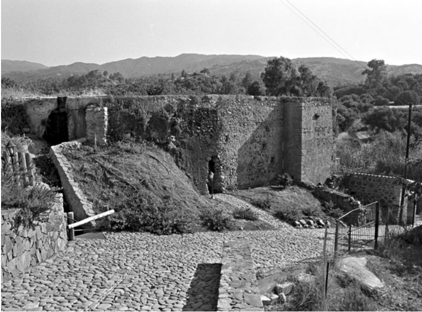
Figure 3 Molos watermill (1690). The water passes along the aqueduct from the left to the penstock on the right. The cross and inscription (figure 6) lie directly under the projecting block in the side of the penstock (Chris Parks).

These nodes are the recipients of long-distance connections and flows, carried along in the water of a river or channel, and on the road, mule-path or animal track. The same river that brings the power for the mill brings water for drinking and irrigation, sediment for fields, and rounded, igneous river stones for building mills and the foundations of houses; it drives conviviality through its wide-ranging interconnections and flows (Edgeworth 2011, 19; Krause and Strang 2016, 633). Of the 24 mills in the TAESP survey area, all but six are fed by the Karkotis river. This drains half of all land in Cyprus lying above 1,650 metres, including the highest points of the island, and has the shortest route to the sea (figure 1; Boutin et al. 2013, 53). It brings both volume and power.