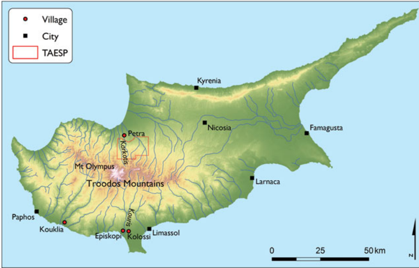
Figure 1 Map of Cyprus. TAESP = Troodos Archaeological and Environmental Survey Project (Michael Given). (Colour online)

the Lusignan (1191–1489) and Venetian (1489–1571) periods. I will finish by considering how players such as millers, customers and archaeologists engage with the politics of conviviality, both past and present.