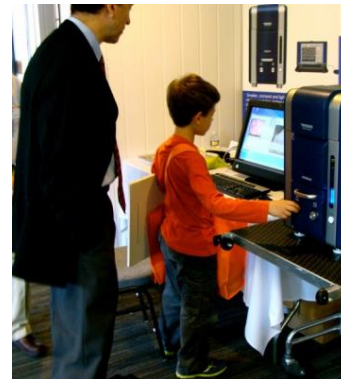
Figure 3. A young NESM member checking out a bench-top SEM at a vendor table at NESM 2013 Spring Symposium.