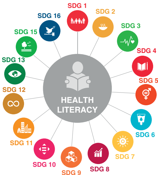
Fig. 6.1 SDGs influenced by strengthening health literacy

Within the WHO European Region, health literacy is recognized as an enabling measure to advance the implementation of the 2030 agenda by strengthening leadership and governance, reducing health inequalities, preventing disease, establishing healthy settings and achieving universal health coverage, and to achieve the highest attainable