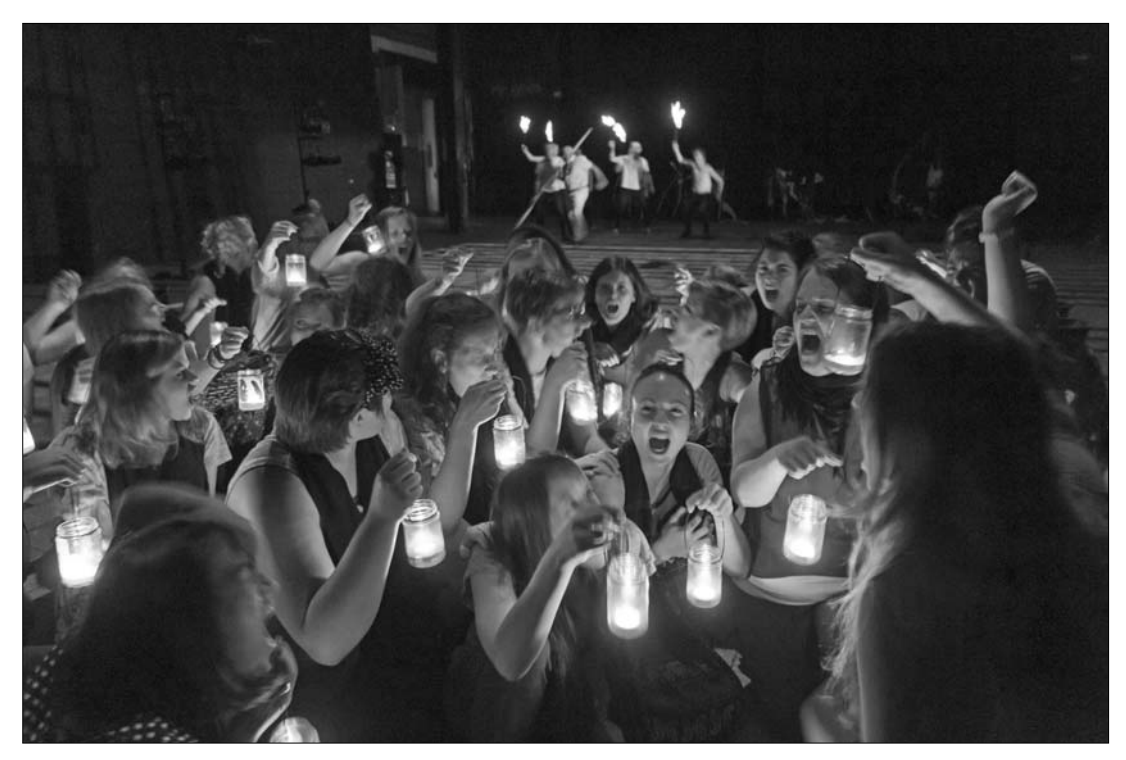
The Community Chorus in The Suppliant Women, the Lyceum, Edinburgh.

This demand resonates with an important feature of agonistic theory, as articulated by Mouffe, which explicitly endorses multiple models of democratic practice, based on the differing requirements and preferences of geographically or culturally distinct populations. Proceeding from a critique of the 'unipolar' power distribution of international politics since the Cold War, Mouffe argues that 'the absence of recognized alternatives' to 'the universalization of the Western model' has hindered many populations from 'finding legitimate means of expression' for their own democratic aspirations.<sup>52</sup> In Agonistics , she argues for the need to 'relinquish the claim that the process of democratization should consist in the global implementation of the Western liberal democratic model', 53 instead advocating 'a pluralist approach that envisages the possibility of multiple articulations of the democratic ideal of government by the people',54 permitting the agonistic disputes and confrontations necessary to democratic discourse to be played out in diverse ways in a 'multipolar' variety of locales and contexts.<sup>55</sup>