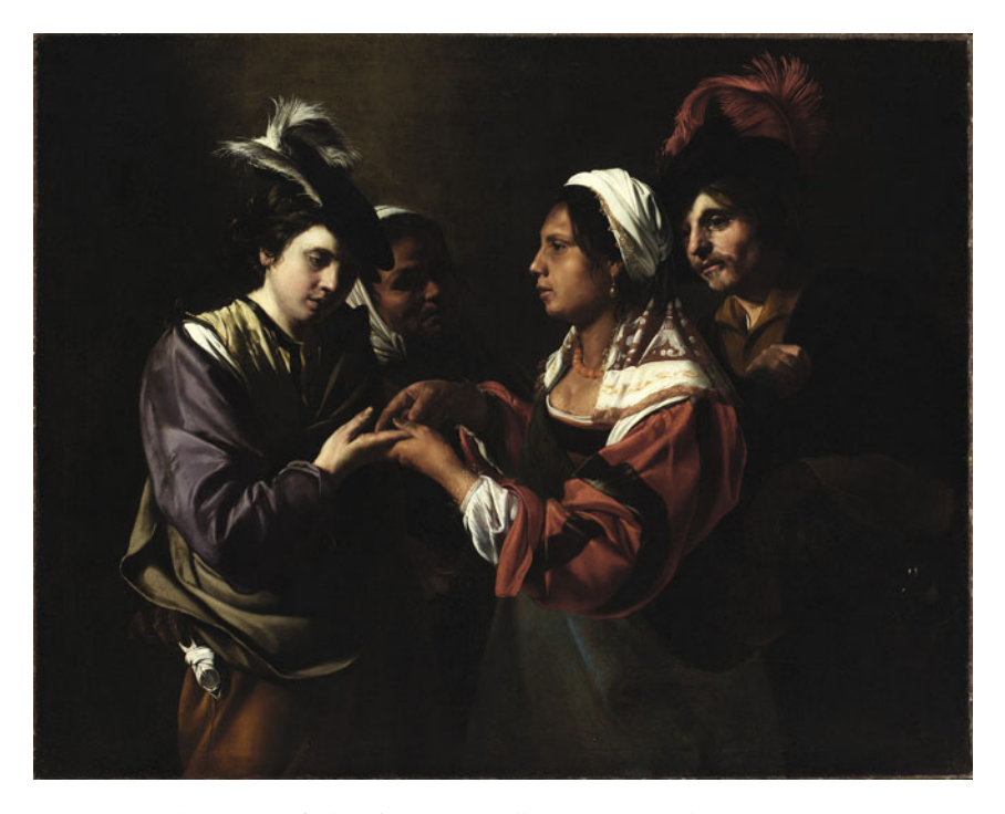
Figure 2. Bartolomeo Manfredi. The Fortune Teller , 1616–17. Oil on canvas. Detroit Institute of Arts, Founders Society Purchase, Acquisitions Fund, 79.30.

seems to have gotten particular traction in seventeenth-century popular culture.<sup>29</sup> In 1617, John Minsheu defined "Gypsies" as