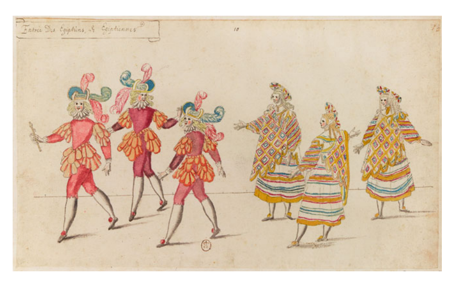
Figure 1. Daniel Rabel. Entrée des Egiptiens et des Egiptiennes, 1631. Drawing. Bibliothèque nationale de France.

chromatic spectrum for Romnia's complexion. That spectrum ranges from pale brunettes (as in Jacques Callot's famous Bohemian etching series from the 1620s and Frans Hals's well-known 1628 "The Gypsy Girl"), to exotic working-class women whose light brown skin and sleek black hair contrast with the pale skin and dark blonde hair of European burghers (as in Bartolomeo Manfredi's 1616-17 The Fortune Teller [fig. 2] and Simon Vouet's 1620 "The Fortune-teller"), to dark-skinned women whose hair texture is either hidden by a head scarf (as in several works by Nicolas Régnier from the 1620s) or coiled and braided like the hair of sub-Saharan women (as in Nicolas Cordier's marble and bronze sculpture La zingarella [The Gypsy girl, 1607– 12]) (fig. 3).