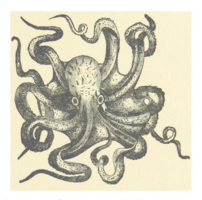
Fig. 3. octupy: oc·tu·py / äkta·pī / verb. To access and transform various institutions in an active yet constructive manner, with the dual goal of participating in and connecting with a shared goal. British Library HMNTS 10492.ee.20. BUTTERWORTH, Hezekiah, 1891.