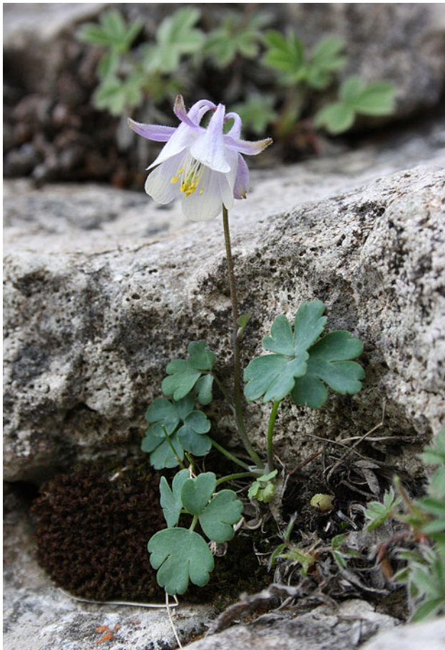
PLATE 1 Aquilegia pawi Font Quer growing in the Montcaro area of the Els Ports Massif.