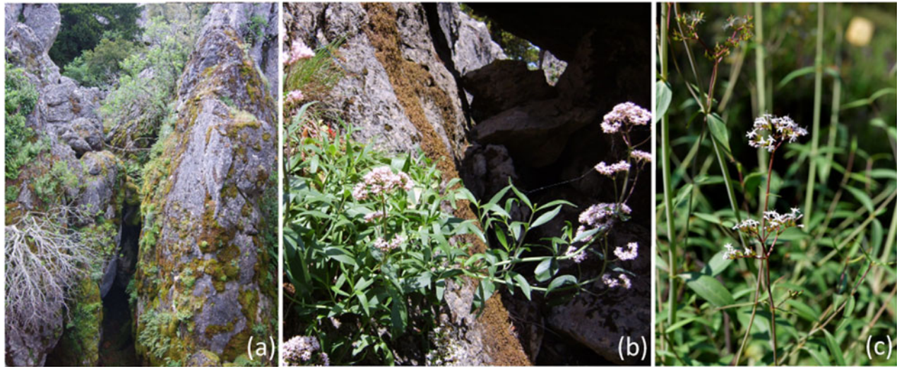
PLATE 1 (a) Characteristic habitat of Valeriana amazonum , (b) the species in its habitat, and (c) detail of inflorescence.

the grazing of wild ungulates (the mouflon Ovis aries musimon ), and the natural collapse of limestone cliffs, which could cause a reduction in the population size (Bacchetta et al., 2008). Currently, this species is categorized as Critically Endangered because of its limited range, small population size and an inferred continuous decline, but this assessment needs updating (Fridlender, 2006).