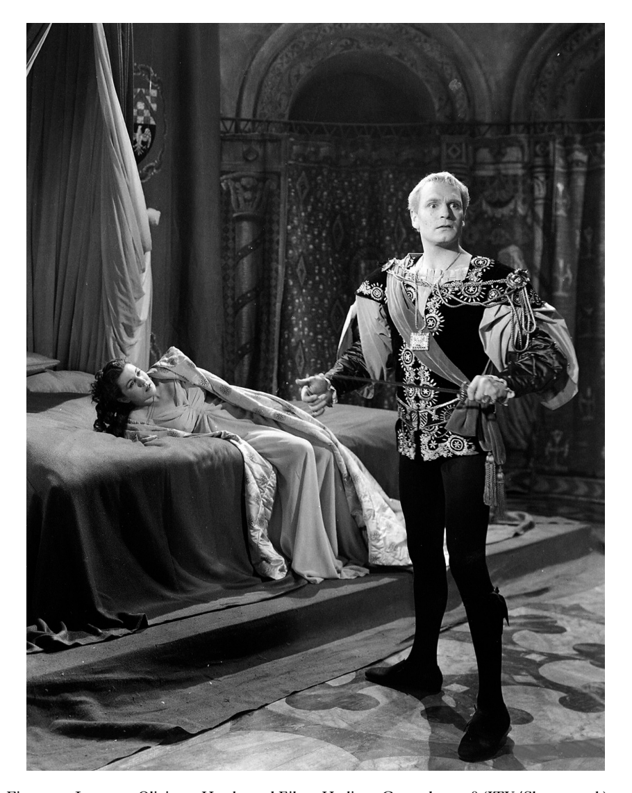
Figure 7 Laurence Olivier as Hamlet and Eileen Herlie as Gertrude, 1948

portrayal of Hamlet as both elegant hero and bitter satirist, and Laurence Olivier's performance, directed by Tyrone Guthrie, of Hamlet as an athletic, energetic prince psychologically fractured by Oedipal desire.