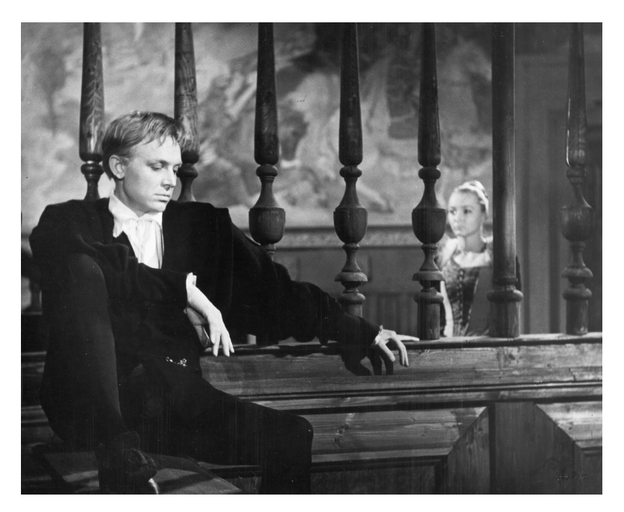
Figure 15 Innokenti Smoktunovsky as Hamlet in the 1964 film Hamlet , directed by Grigori Kozintsev

as we observed above, a signature moment in the history of the play's performance, announcing its affiliation with trends in both theatrical abstraction and psychological realism. In 1954, Grigori Kozintsev directed a production in Leningrad (now St Petersburg again) using a translation by the novelist Boris Pasternak; his film version of 1964 advanced his vision of a Hamlet beset by external sources and for whom thinking itself was an act of political resistance.<sup>1</sup>