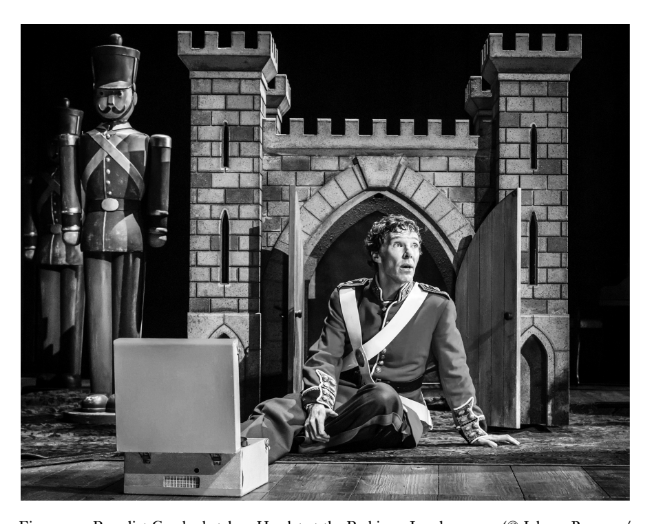
Figure 11 Benedict Cumberbatch as Hamlet at the Barbican, London, 2015

The RSC's 2017 production, with a set-design of oil-cloths painted with brightly coloured graffiti, featured a predominantly black cast; the young Paapa Essiedu played Hamlet as 'young, quick-witted, and ... sportive'.