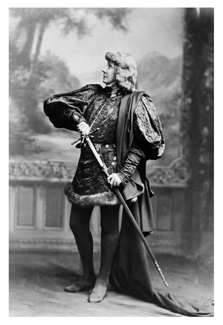
Figure 17 Sarah Bernhardt as Hamlet in the 1900 film directed by Clément Maurice

When the renowned French actor Sarah Bernhardt addressed the role at the turn of the twentieth century, there had been some fifty travesti performances in England and abroad (including France, Italy, Austria, and Germany).