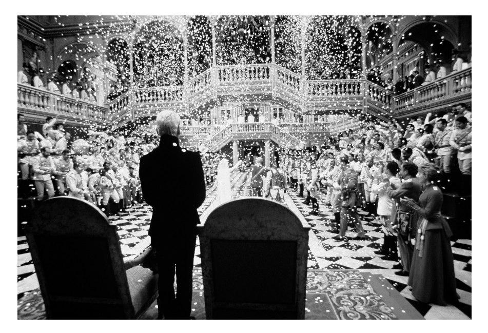
Figure 9 Kenneth Branagh as Hamlet, 1996

delivery of 'to be or not to be' in front of a spread of mirrored walls turned introspection into highly self-conscious performance.