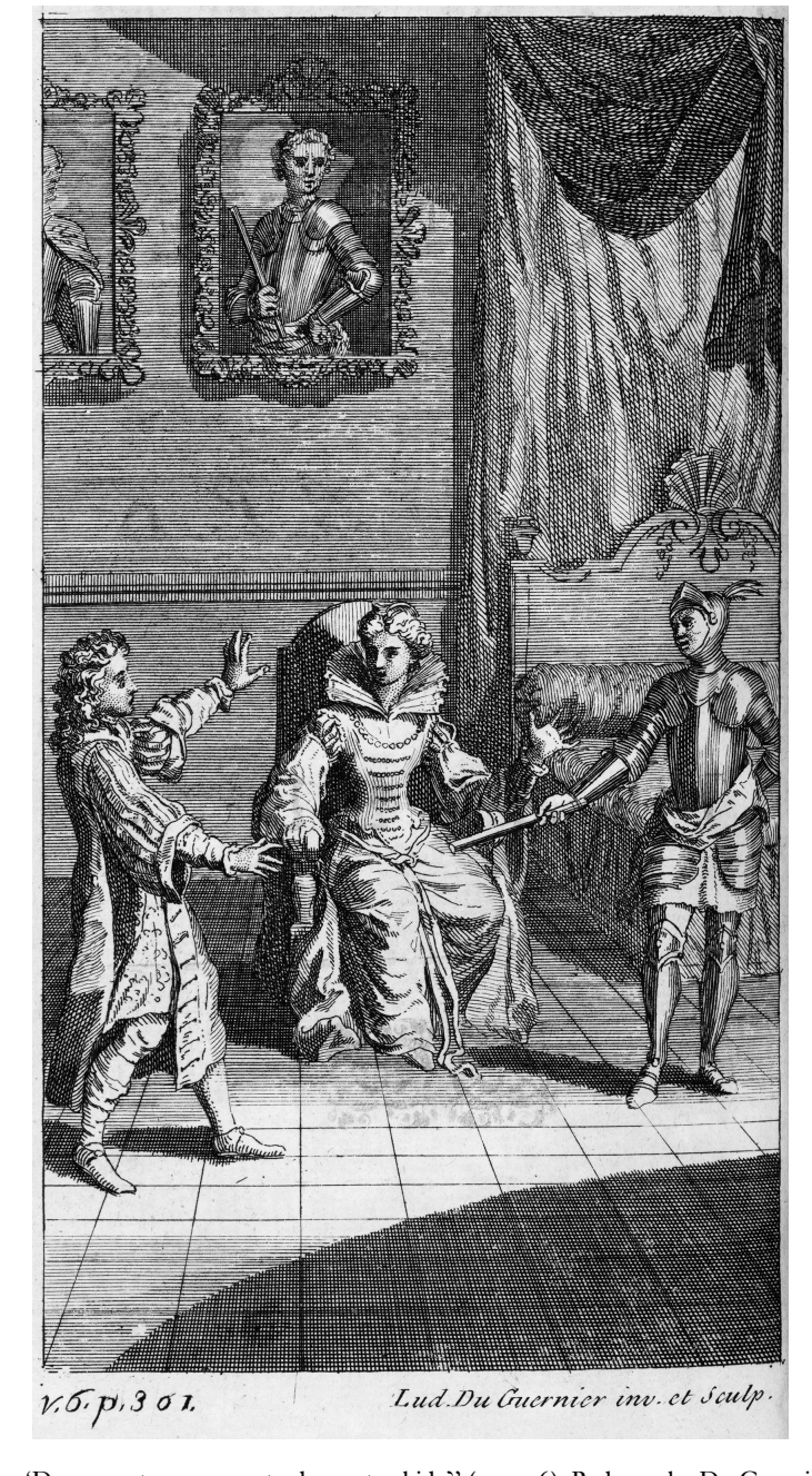
Figure 1 'Do you not come your tardy son to chide?' (3.4.106). Redrawn by Du Guernier for the 1714 edition of Rowe's Shakespeare (Folger Shakespeare Library)