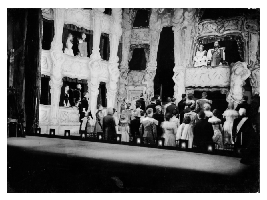
Figure 13 The Mousetrap scene, Berlin, 1926, directed by Leopold Jessner

what Jessner considered the 'essence' of the play, the rottenness of Denmark (and not the melancholy of the prince). All aspects of the production's design were meant to reinforce this vision and its potential to critique both the pre-war imperial and the post-war Weimar regimes. It culminated in the set for the Mousetrap scene, which included elaborate boxes for Claudius and Gertrude that mirrored the real interior of the Staatstheater.