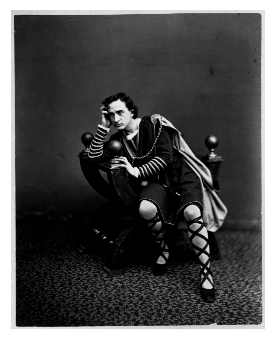
Figure 3 Edwin Booth as Hamlet circa 1870

twentieth century. Victorian productions of Shakespeare were highly pictorial, with expensive, elaborate set designs and a proscenium arch that separated audience from actor. Practitioners such as William Poel wanted to dispense with these customs in order to recover the original practices of Elizabethan performance, with its limited stage trappings and fast pace. In 1881, Poel oversaw an amateur performance of QI Hamlet on a bare platform stage in London; this initiated an interest in the staging of the first