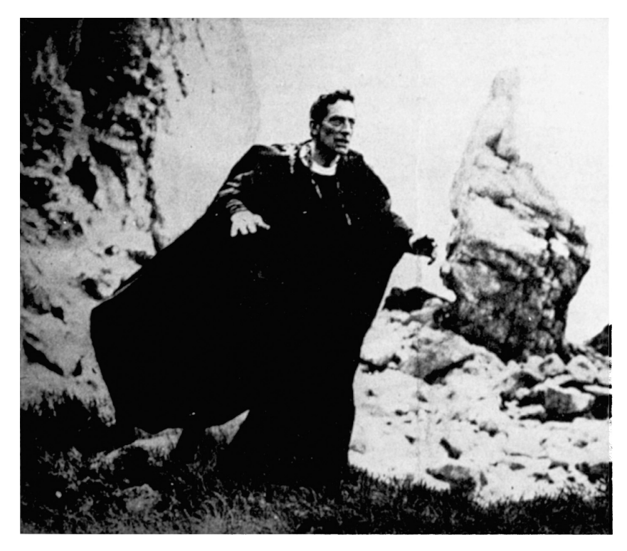
Figure 5 'Go on, I'll follow thee' (1.4.86). Johnston Forbes-Robertson as Hamlet in a 1913 film (Mander and Mitchenson Theatre Collection)

quarto that continues today. In 1897, Johnston Forbes-Robertson tried to get closer to the original Hamlet by restoring Fortinbras to the play's conclusion. And in 1899–1900, at the Shakespeare Memorial Theatre in Stratford-upon-Avon, F. R. Benson produced a complete Hamlet – the whole play as it appears in standard editions (Q2 combined with F). It took six hours to play.