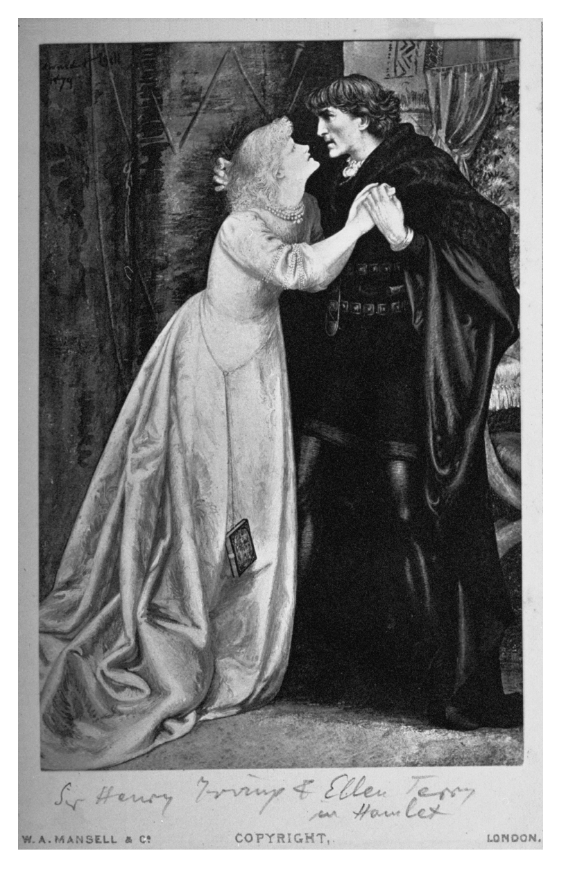
Figure 4 Ellen Terry as Ophelia and Henry Irving as Hamlet