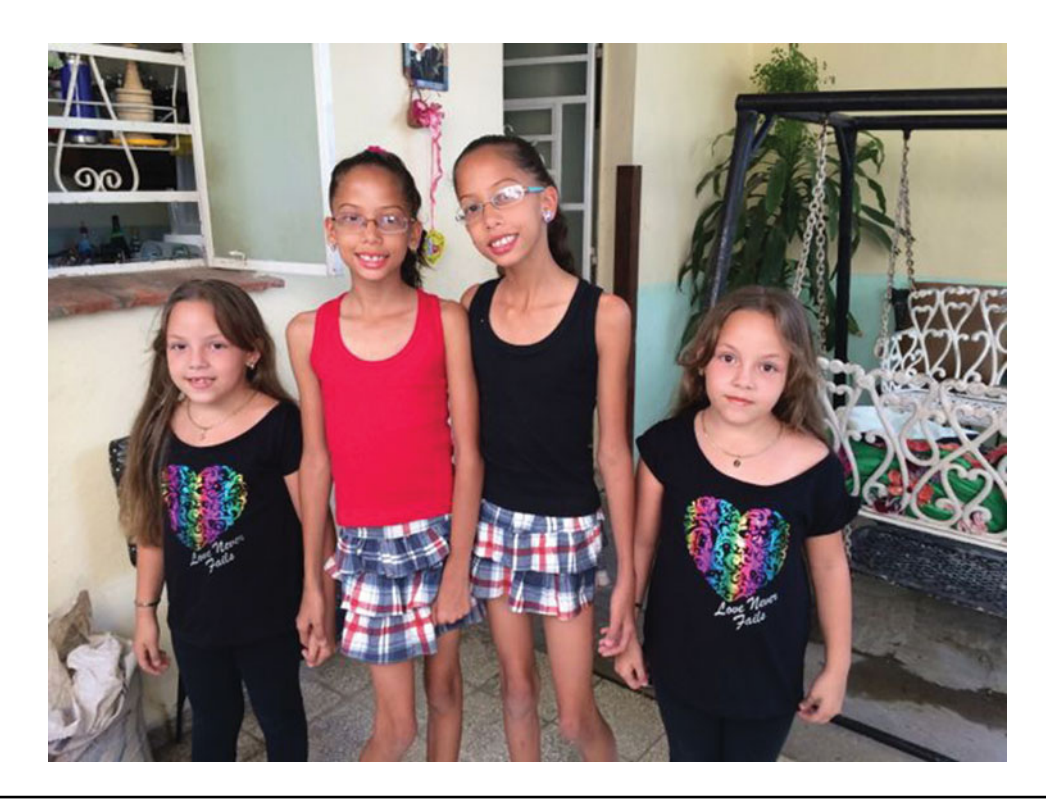
FIGURE 1 (Colour online) Two sets of MZ female twins living on the 'Street of Twins' in Hanava, Cuba.

Registry (CTR) in the special 2012 registry issue of Twin Research and Human Genetics . The large size of the registry and the considerable amount of twin data available are impressive.