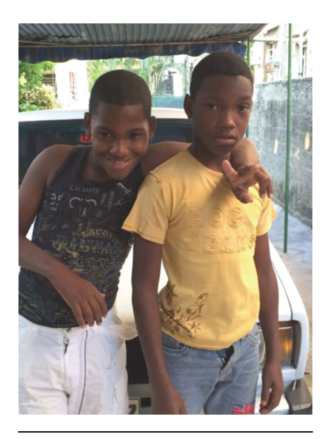
FIGURE 2 (Colour online) A set of DZ male twins living on the 'Street of Twins' in Havana, Cuba. Photo credit: Nancy L. Segal.

Toward the end of my visit, our group traveled to Jaimanitas, a fishing town on the northwestern edge of Havana