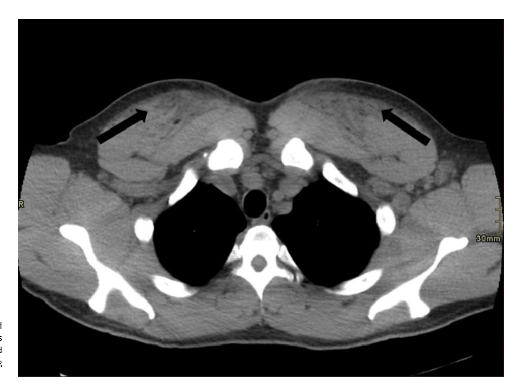
Figure 1: CT thorax demonstrating a striated pattern within enlarged pectoralis muscles along with subcutaneous locules of gas and fat stranding (arrows). Findings are in keeping with paraffinoma at the site of injection.