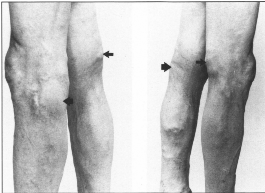
Figure 1 – Photographs of both legs from an oblique view to show the swelling in the right (smaller arrow) and left (larger arrow) popliteal fossae.