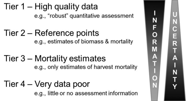
Figure 2 A simplistic representation of how decision makers might experience different potential combinations of information quantity and quality. An adaptive management approach would emphasize identification and reduction of key uncertainties in order to progress to a more learned state (for example one with more informative data). Examples of the implementation of a tiered approach to resource management can be found in Dowling et al. (2008) and Smith et al. (2008).

In much the same way as models exist as simplifications of reality, target RPs exist as simplified metrics representing achievement of an objective. Thus, viewing RPs as performance targets is also relevant here, but must be approached with careful attention to: (1) whether the RP represents a fundamental or a means objective, and (2) if the latter, what assumptions are required to get from means to fundamental. However, recognizing how trigger RPs