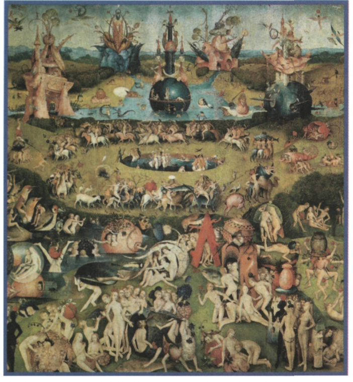
The Garden of Earthly Delights, by Hieronymus Bosch. Museo del Prado, Madrid, Spain.