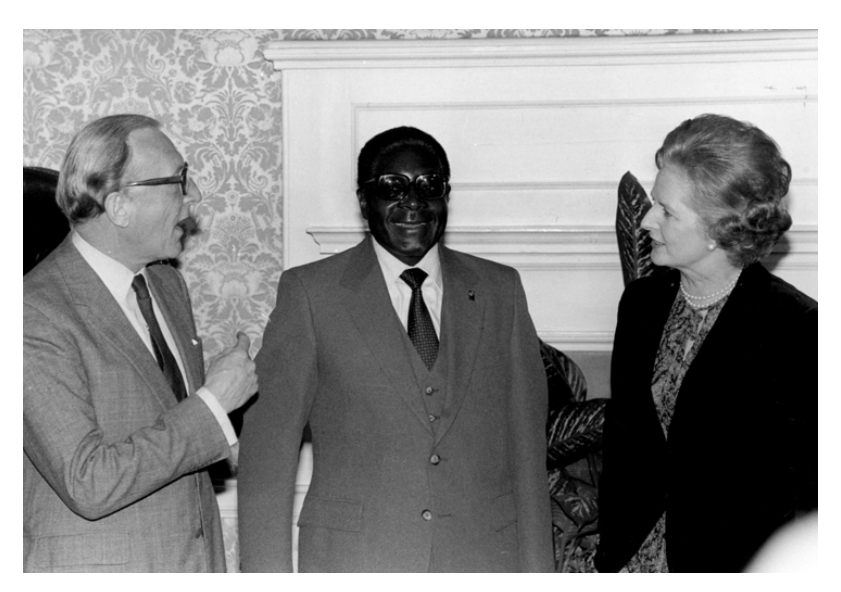
Figure 8 Prime Minister Robert Mugabe with Prime Minister Margaret Thatcher and Lord Carrington. May 9, 1980.

the South Africans should not think that he had been misleading them. He genuinely did not know this."<sup>48</sup> Days before the Independence Day ceremonies, Mugabe was positioning himself as the trustful neighbor of South Africa, while castigating Nkomo as the potential problem given his past political and military alliances with the South African ANC.