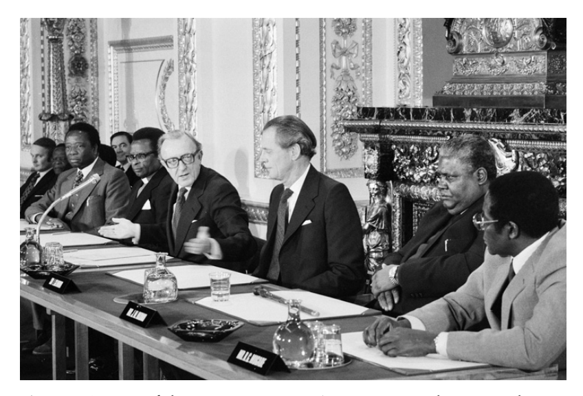
Figure 7 Signing of the Lancaster House Agreement. London, December 21, 1979.

ceasefire agreements, focusing in particular on the presence of South African troops in Rhodesia in the months leading up to the election. Mugabe sent a letter to Thatcher on January 8, 1980, where he threatened to break the Lancaster House arrangements if the South African military presence was not addressed by the British.<sup>2</sup> From the perspective of the FCO, the presence of the South African troops threatened the transition, mostly because of protests from the OAU and, most importantly, the Nigerians that the South African troops in Zimbabwe-Rhodesia were a violation of the Lancaster House agreement. Discussing how to respond to Mugabe's claims, Charles Powell of the FCO's Rhodesia Department admitted that "there is no alternative to accepting, for the time being, the continued presence of the five South African companies, though wearing Rhodesian uniforms and under Rhodesian command." Powell suggested that the British could split hairs in terms of the language used to describe the situation. "In the meantime we need a new press line – to be agreed with the South Africans - which admits and justifies the existence of the South African unit guarding Beitbridge, but says that the Governor has been assured that there are no other South African forces (as opposed to