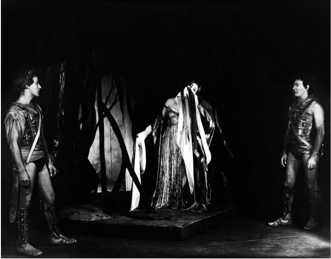
1. Vivien Leigh in an abstract forest, with scarlet and white streamers flowing from her mouth and wrists (1955).

modern English drama. Before I turn to the significance of these factors on the performance text that I will consider in most detail (Julie Taymor's filmed Titus of 1999) however, I want to consider a number of key theatrical productions from recent years, in order to establish a performative genealogy for this play and the character of Lavinia during the second half of the twentieth century and onwards.