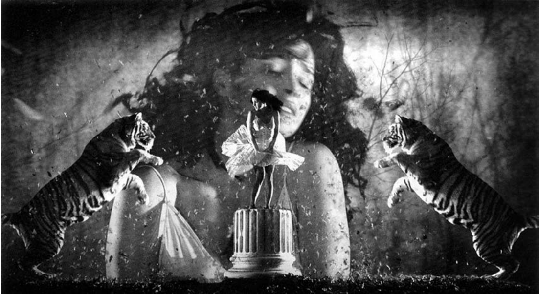
8. Lavinia as Marilyn on a classical column being attacked by Chiron and Demetrius in the form of tigers, from the PAN following her revelation of the rape.

transformed into a fawn, with a doe's head and hooves, which she uses to try to keep her billowing skirts in check (Illustration 8).