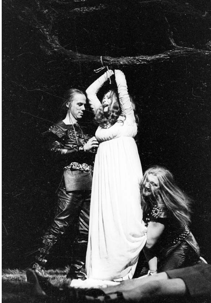
3. Janet Suzman as Lavinia, hung up on a tree at the beginning of the assault by Chiron and Demetrius.

Lavinia's plight was indicated not by buckets of blood, but by a coating of clay or mud applied to her body, through Ritter's posture, and in the improvised bandages that had been applied to her stumps (Illustration 4). Presented in its entirety in one of the rare examples of textual fidelity since