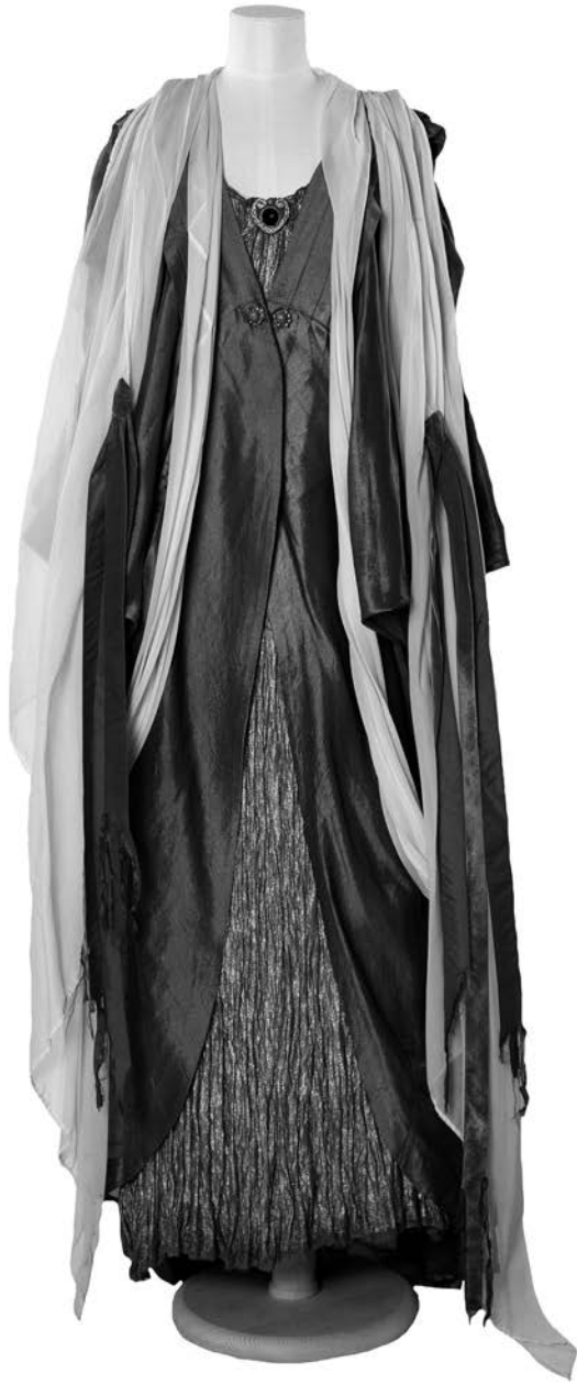
2. Lavinia's dress, designed by Peter Brook. Note the crumpled fabric of the underskirt, resembling tree bark.

the same time they speak in the new language of the post-Artaudian theatre in which stage events are