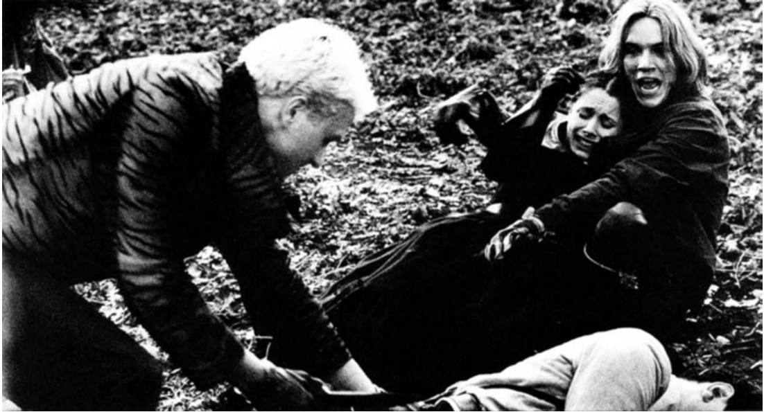
6. Black and white still from Titus: The Illustrated Screenplay . Note the grainy nature of the image, evocative of high-speed, low-light news photography, and the limited depth of field.

with a knife in close-up (08:18). Chiron subsequently swaps positions with his brother, straddles Lavinia from behind and rips open her dress, once again in close-up, to reveal Lavinia's naked back together with the straps and bodice of a low-cut corset (08:24). A reverse shot is provided next, in which Lavinia clutches her black dress against her stripped torso in an inadvertent revelation of first one shoulder and then both, together with a view of her falling corset straps (08:28). The scene is disturbing; it invites audiences to contemplate both the trauma of rape and the pleasure of highly eroticized, fetishistic sexual intercourse. It is an audacious directorial choice and, like that of other recent stage directors, it is intended to bring home the social reality of rape, together with a notion of the personal desecration it entails.