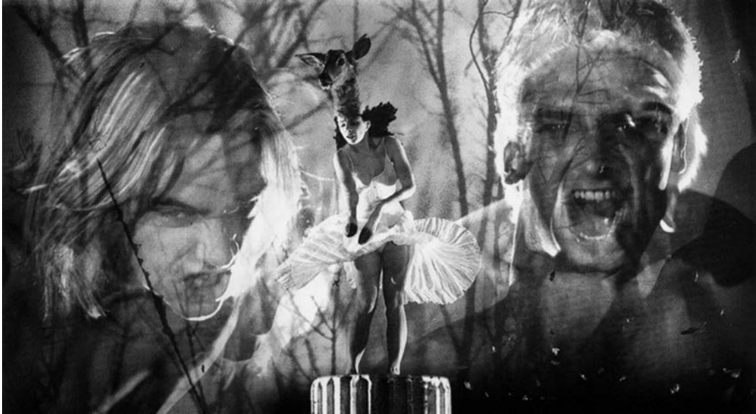
7. Lavinia as Doe/Marilyn being attacked by Chiron and Demetrius in the PAN following her revelation of the rape.

muddy, marshy area of a river delta, with shattered sticklike trees protruding from the riverbed's churned-up mud. The vista is evocative of Augustus John's expressionistic scenery for the World War I scenes of The Silver Tassie (1928), or photographic stills of devastated Flanders battlefields. In this mutilated landscape of shattered trees, which clearly alludes to iconic images of nature assaulted by men, Taymor has decided to place Lavinia on a shattered stump, with twigs sticking into her own 'stumps' as a visual incarnation of the mockery of hands promised to her by Chiron and Demetrius. The result is perhaps the most powerful image of Lavinia as Daphne to have been created in the performance history of Shakespeare's play. 60