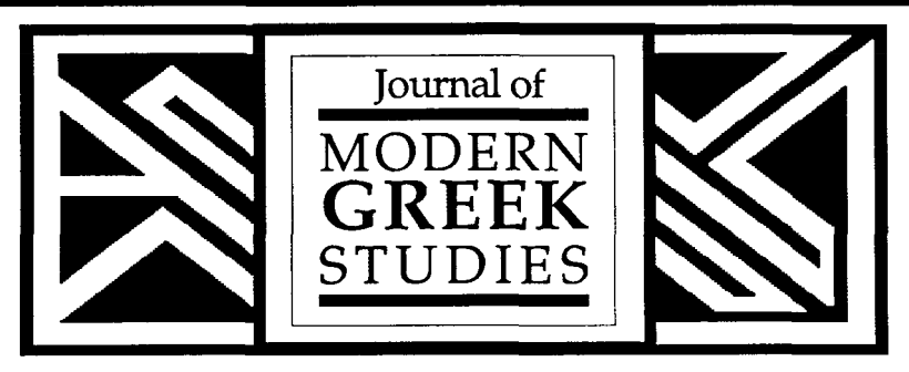
Official Publication of the Modern Greek Studies Association Peter Bien, Editor

Adamantia Pollis' important essay, "The Missing of Cyprus: A Distinctive Case" will be read into the Congressional Record by Senator Joseph Biden. The Senator has also invited the author to testify on the problems of Cyprus before a congressional committee. Subscribe today and read this article and many others in Volume 9, Number 1.