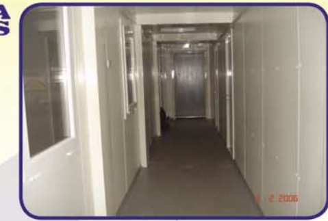
Inside MSF Hospital in Hattian Bala

Number One in the world for partial and turn key solutions incl. Transportation, Erection, Management, Training, Maintenance, Education, Administration, Storage, Out sourcing, Medivac.