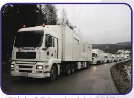
All kinds of clinics or hospitals in MultiSpace