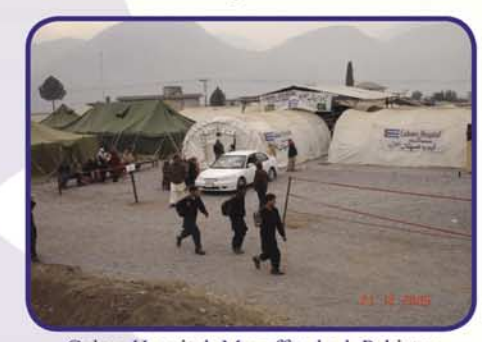
Cuban Hospital, Muzaffarabad, Pakistan