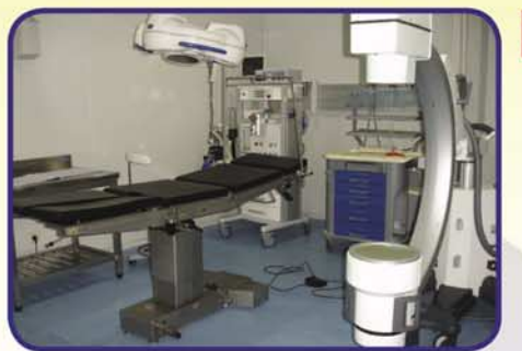
Inside OT in KATIKO Referral Hospital

Number One in the world for partial and turn key solutions incl. Transportation, Erection, Management, Training, Maintenance, Education, Administration, Storage, Out sourcing, Medivac.