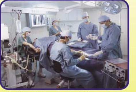
NorBase single and expandable containers