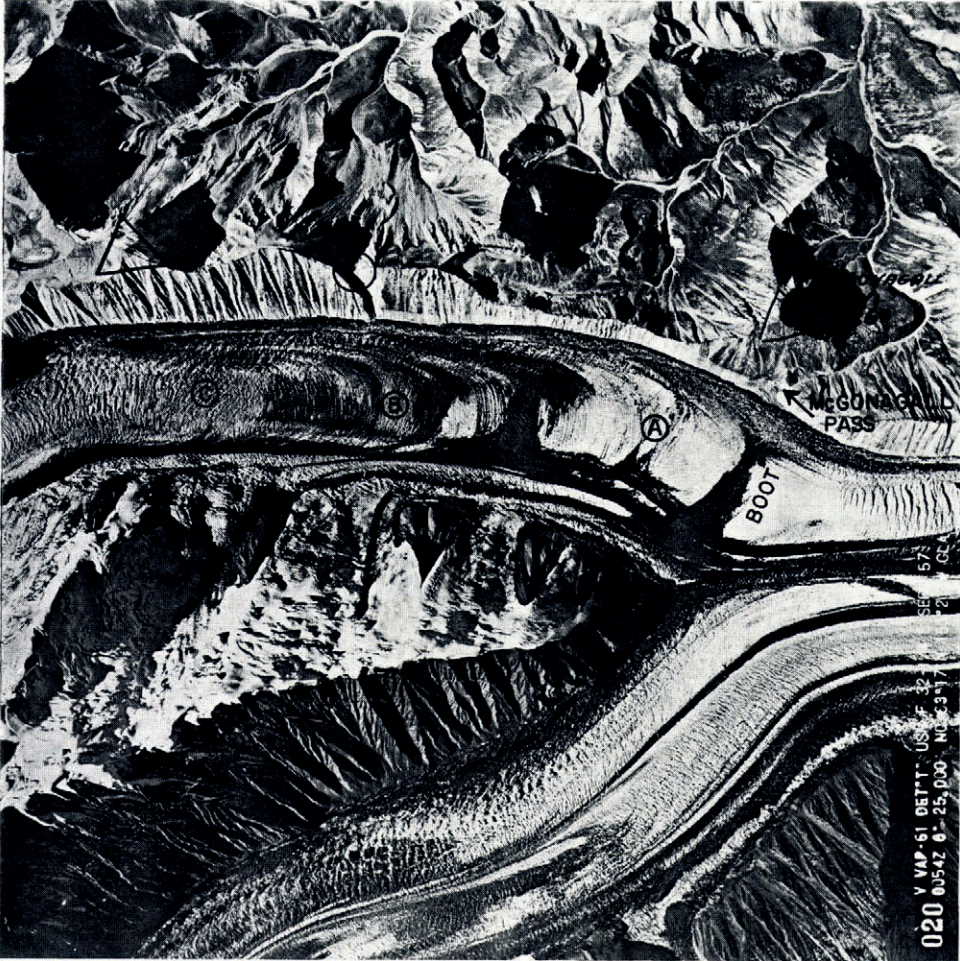
Fig. 2. Aerial photograph of McGonagall Pass and vicinity on 5 September 1957, showing debris patterns used in measuring movement of Muldrow Glacier.

Muldrow Fork above Gunsight Pass, in order to record conditions during this stage of the recovery period. Repetition of stereo photography after intervals of a few years would provide invaluable information on the progress of a normal wave moving into stagnant or less active ice.