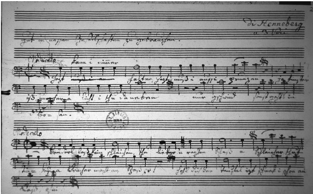
Figure 2 Canons 1–2 by Johann Baptist Henneberg, Staatsbibliothek zu Berlin – Preußischer Kulturbesitz, Musikabteilung, Mus. ms. Autograph J. B. Henneberg 2, page [1]. Used by permission