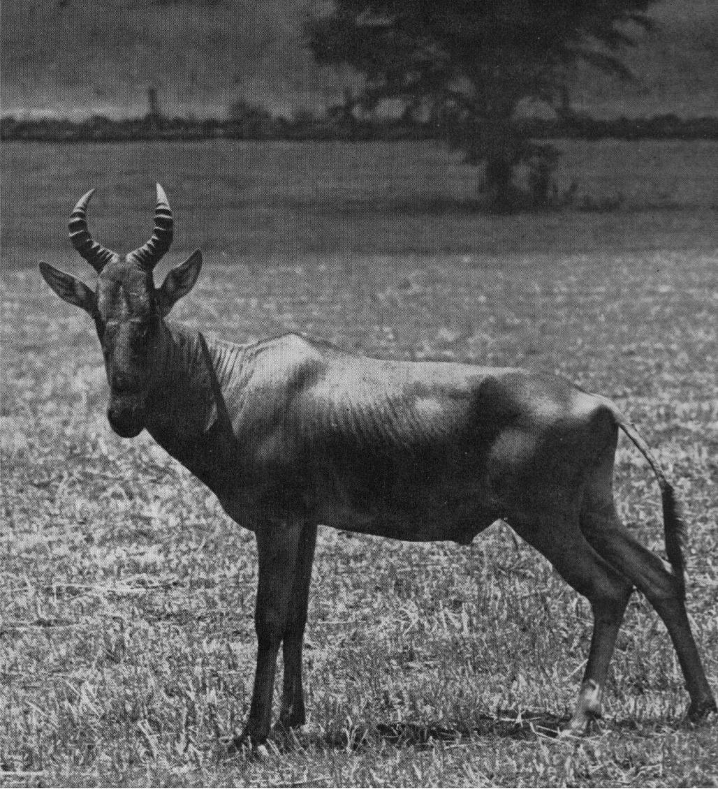
Plate 11 THE LAST NAKURU HARTEBEE