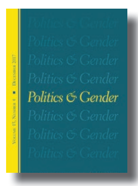
Politics & Gender