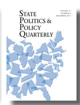
State Politics and Policy Quarterly