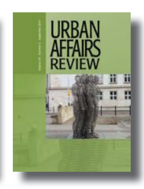
Urban Affairs Review