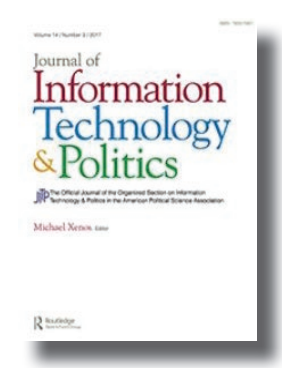
Journal of Information Technology and Politics