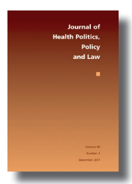
Journal of Health Politics and Policy Law