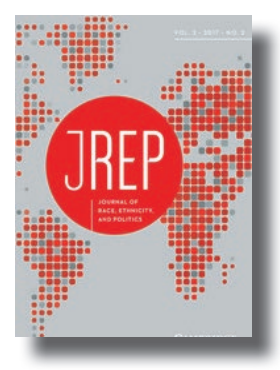
Journal of Race, Ethnicity, and Politics