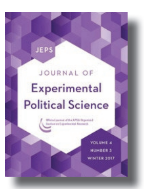
Journal of Experimental Political Science