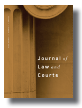
Journal of Law and Courts