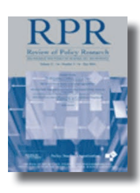
Review of Policy Research