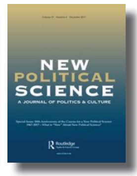
New Political Science