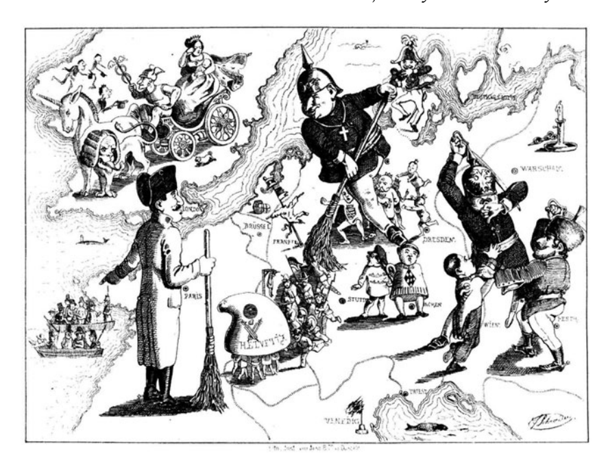
Figure 2. Ferdinand Schröder, 'A Survey of Europe in August 1849'.

imperial Great Powers and reasserting the old civilisational hierarchies. The people of Europe could not 'exist in the same now'. ^{71}