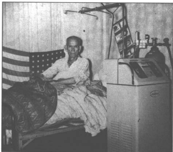
Illustration from Black Lung