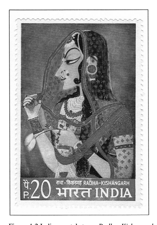
Figure 1.2 Indian postal stamp Radha–Kishangarh . Issued in 1973. Based on Portrait of Radha attributed to Nihālcand. Ca. 1740. Ministry of Communications, Government of India, 1973