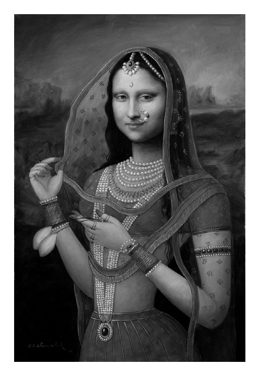
Figure 1.1 Bani Thani by Gopal Swami Khetanchi. 2006. Jaipur, India. Oil on canvas. 50.8 \times 76.2 cm. Courtesy Gopal Swami Khetanchi.