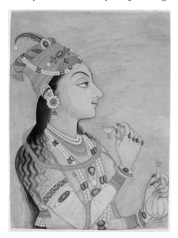
Figure 1.4 Idealized Portrait of the Mughal Empress Nur Jahan (1577–1645). Ca. 1725–50. Kishangarh, Rajasthan. Opaque watercolor and gold on paper. 29.52 × 21.59 cm. Los Angeles County Museum of Art, Gift of Diandra and Michael Douglas (M.81.271.7).

identifications of the sitter can be understood with reference to the male-exclusive spheres of power within which portraits circulated, namely the genealogical record and gift-giving to ensure allegiance (Aitken 2002: 254–6).<sup>22</sup> Here, the question whether painters had access to palace women to sketch a portrait based on observation looms large. It seems self-evident that