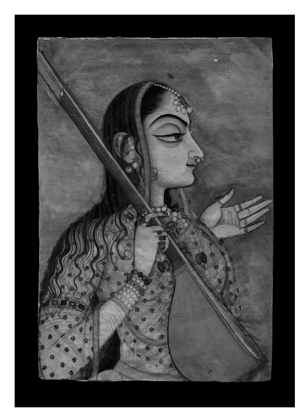
Figure 1.5 A Lady Singing . Ca. 1740–5. Kishangarh, Rajasthan. Painting on paper. 48.2 \times 35.2 cm. Collection of Howard Hodgkin, loan to Ashmolean Museum, Oxford (LI118.31).

behavior of the women" (Mishra 2018: 137).<sup>26</sup> Molly Aitken has sought to nuance this common assumption, citing examples that show it was at least not inconceivable painters had access to palace women (2002: 149–51), though she hastens to specify that the women were portrayed not individually but conventionally, with the stylistic face of the local school of painting (272–5).<sup>27</sup>