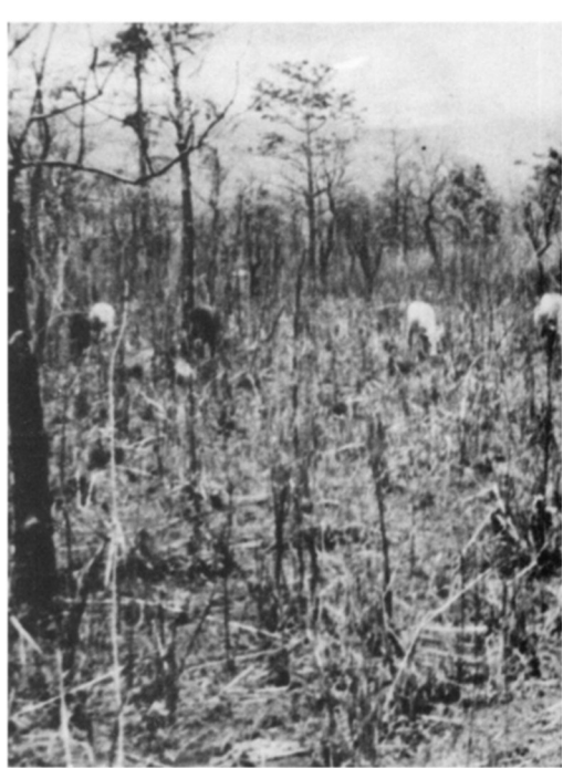
THATCH SCRUB before burning . . .