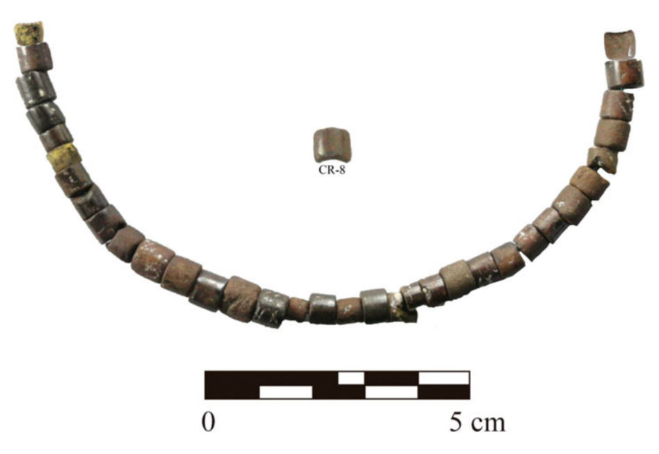
Figure 1. Iron-ore beads found as an offering associated with Burial 13 in Structure 13R-10 from La Corona.

the Universidad del Valle de Guatemala (CIAA-UVG), with direct collaboration from the Center for Research and Development at Cementos Progreso (CI + D/CETEC), the Institute of Earth Sciences, Academia Sinica in Taiwan (lizuka et al. 2020), and University of Bradford, UK. This cooperation allowed the use of specialized equipment for different objectives: analysis of crystalline solids through XRD, determination of elemental composition through SEM with an EDS detector and energy-dispersive X-ray fluorescence (EDXRF), and identification of chemical compounds with Raman spectroscopy. Recently, this project has joined the Red Reflejos, a collaboration network for the study of pyrite mirrors in Mesoamerica and Central America, led by Matthieu Ménager and Silvia Salgado, from the Universidad de Costa Rica.