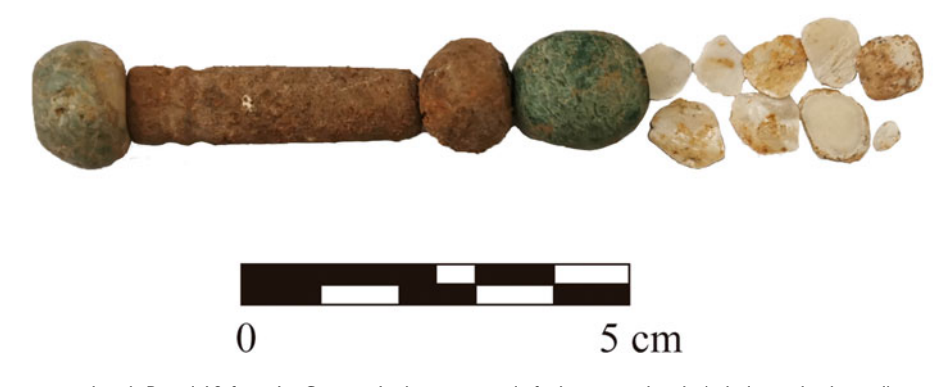
Figure 2. Offering associated with Burial 18 from La Corona. It shows two calcified iron-ore beads (tubular and spherical), combined with jade beads and shell fragments.

The microtextures and mineral chemistries were studied non-invasively using SEM. Identification of mineral phases