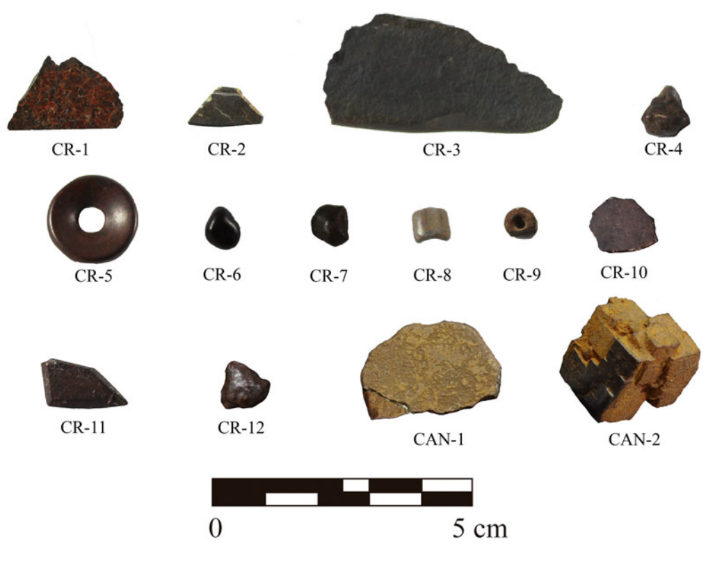
Figure 3. Geochemically analyzed iron-ore artifacts from La Corona, El Achiotal, and Cancuen.

was made by an energy-dispersive spectrometer detector. Samples were directly loaded into the specimen chamber without sample polish and any coating of conductive material such as carbon or gold. Due to the work requiring collaboration between several different laboratories, SEM-EDS was carried out with different equipment and in different working conditions: one field emission scanning electron microscope (JEOL JSM-7100F, with EDS: Oxford Instruments Ltd, X-max 80 operated by INCA-350, low-vacuum conditions (50Pa) were used with purged nitrogen gas); one scanning electron microscope with EDS detector under low-vacuum conditions (JEOL, JSM-IT500, detector model X-Max); and one scanning electron microscope with EDS detector under