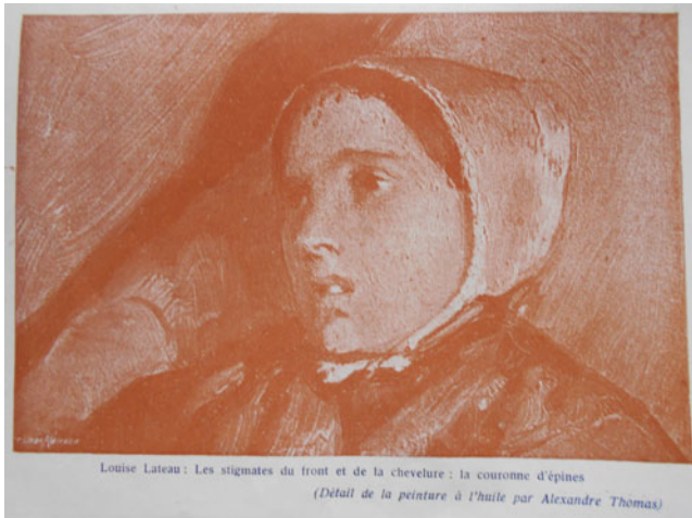
Figure 5. Print of a smaller painting of Louise Lateau by Alexandre Thomas: Almanach National Belge Notre Dame de Lourdes , Louvain 1914, 53.

there are references to the Holy See demanding the retraction, with the bishop of Tournai only echoing their demand. 41 Rome was always very careful in these matters and wanted to deflect from these exceptional souls anything that ‘might obscure divine action or be open to malicious interpretations’. 42 As Dumont noted, ‘Everything was premature and untimely’. 43 What happened in Louise’s case was in fact similar to the measures taken in 1924 by the head of the cloister of San Giovanni Rotondo in the case of Padre Pio (1887–1968). He forbade pictures being made of the Italian stigmatic in order to avoid the accusation of the commercialisation of the cult. 44