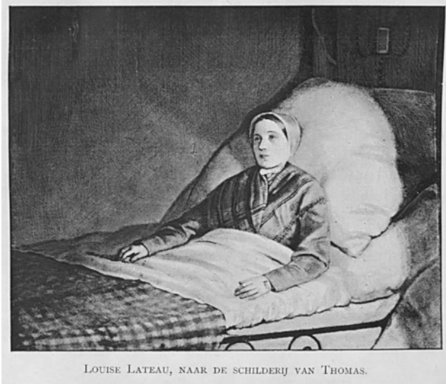
Figure 6. Drawing based on the larger painting by Alexandre Thomas: Riko, Louise Lateau en andere mystieken , frontispiece.

made it into the public realm were just like the photographs of Bernadette, each one ‘a safe and controllable image’. 59 In fact, those involved in the 1877 affair seem only to have distributed the ‘natural’ photographs among their friends. 60