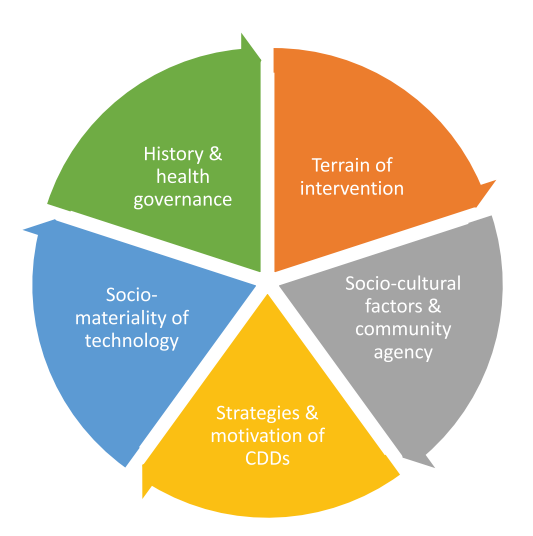
Figure 1. Five domains for assessing the effectiveness of MDA programmes for trachoma in Maasai communities.

Impressions and interpretation of the themes were discussed with the native-speaking interviewer and co-authors. Using an analytical framework adapted from Bardosh (2018), themes were classified into the framework domains (Figure 1). The domains were modified for the local Maasai context and for the type of data collected specific to trachoma. Narrative text was applied around the framework and direct quotes presented are used to show dominant views of participants.