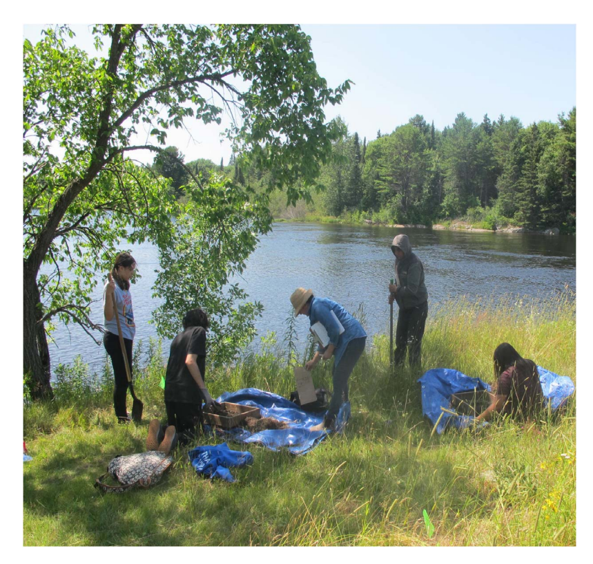
Figure 2. Test pitting component of the Indigenous Archaeological Monitor training at Mississauga First Nation. Test pitting occurred at the Chiblow 2, where elders observed the work and placed semaa (tobacco) in test pits before they were refilled.