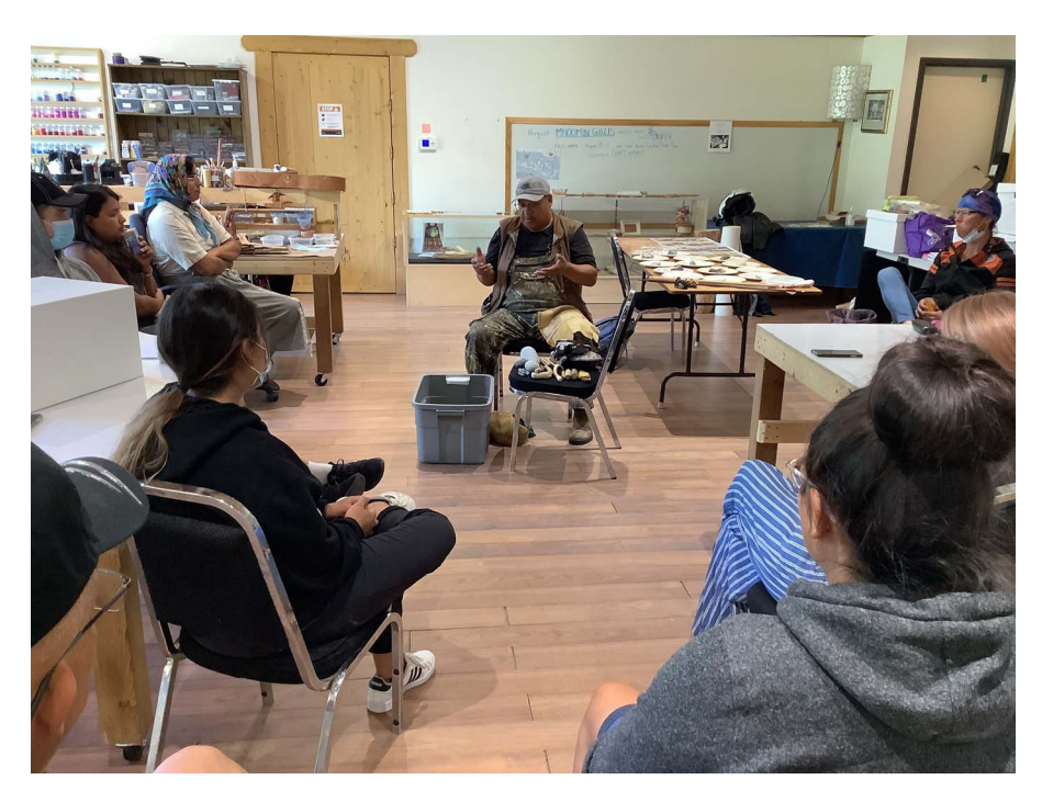
Figure 6. Cataloging workshop participant demonstrates flintknapping for other participants at the Ojibwe Cultural Foundation.

Participants felt that the inclusive path we chose, in which different people shared knowledge, was valuable: future projects should also bring together multiple people and perspectives. The project was not simply about compiling lists; crucially, other learning was involved. They asked us to think of alternatives to computer-based cataloging, such as voice recordings.