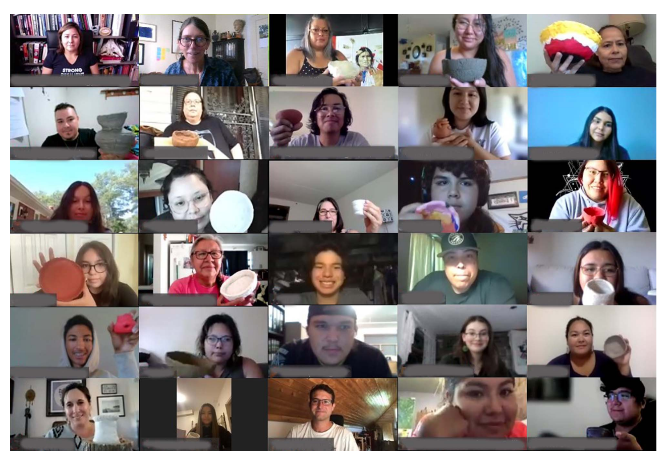
Figure 4. Participants in the 2021 online training demonstrating the ceramic pots created as part of the workshop.

Many other positive outcomes were achieved from this project. We connected communities with the Ontario government so that they can (1) be regularly notified when CRM projects are occurring on their territories and (2) request data sharing agreements and engage in repatriation opportunities. Over the course of the training, we used our approach to include more Indigenous representation and perspectives. We also identified an important