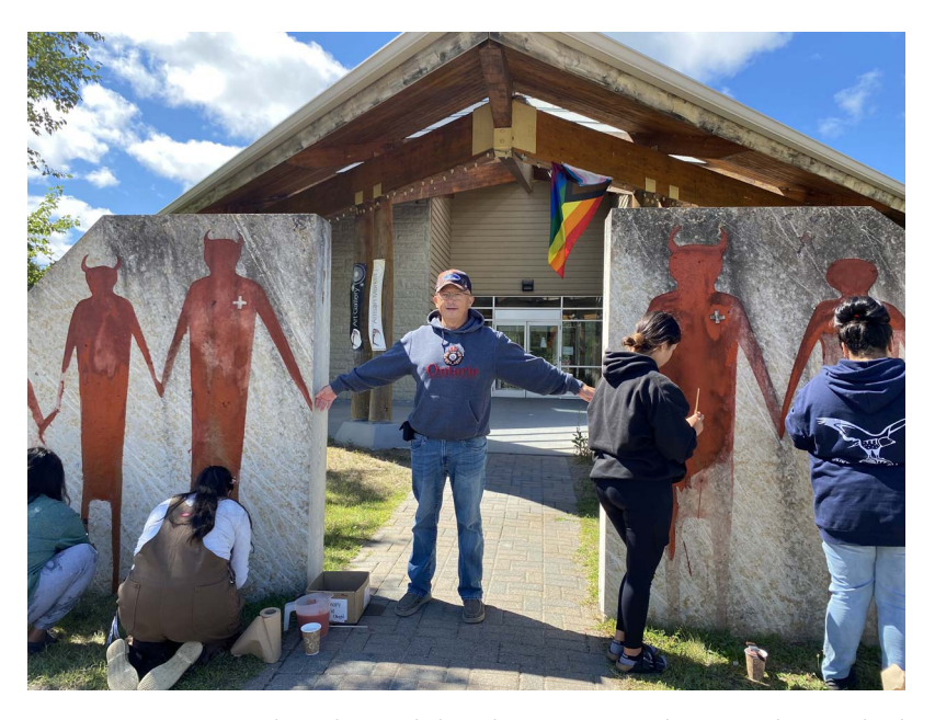
Figure 7. Artifact cataloging participants complete the workshop by repainting the artwork outside the Ojibwe Cultural Foundation with an ochre paint.

Finally, participants expressed that they felt a responsibility to care for belongings and landmarks; this type of work is part of regaining knowledge. One way of caring may include deaccessioning. For example, this collection contains a large number of industrially manufactured items associated with non-Indigenous occupation of the fur trade post. It was suggested that it might be