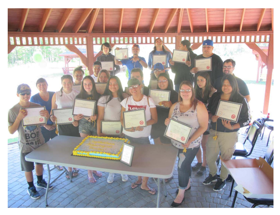
Figure 3. Indigenous Archaeological Monitors at Mississauga First Nation show their certificates before ending the training with a fish fry.