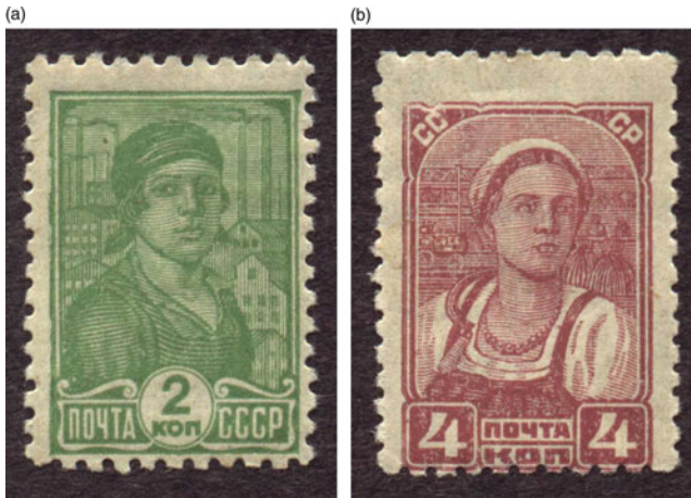
Figure 1. a-b Postage stamps of a woman worker and woman peasant, issued as regular (non-commemorative) stamps, reflecting the importance the state attached to women's labor.