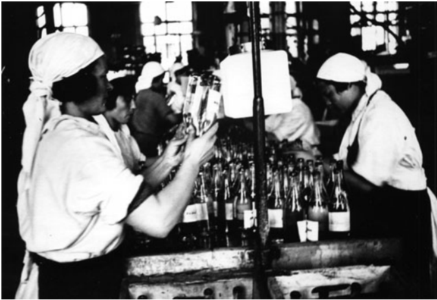
Figure 2. Women Workers in Likernovodochnyi (Spirits and Vodka) Factory, 1937. Women played a critical role in the industrialization drive of the 1930s.