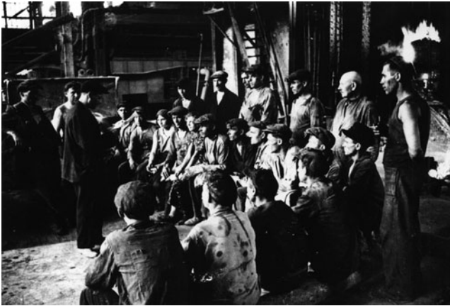
Figure 3. Meeting of workers in Serp i Molot (Hammer and Sickle) factory's open hearth furnace, 1936.