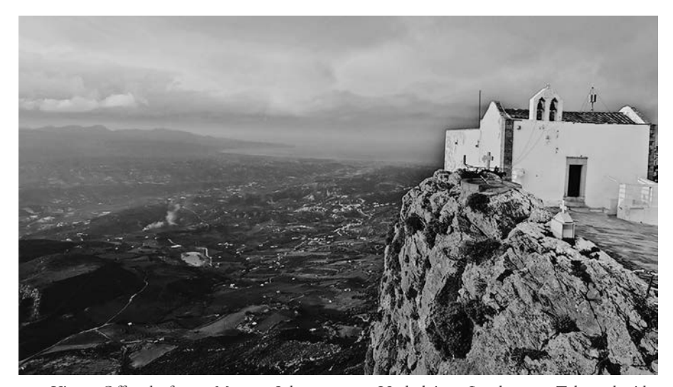
1.3 View Offered from Mount Juktas upon Underlying Landscape, Taken beside Modern Church of Afentis Christos.