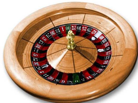
Figure 1: The wheel

Roulette involves a dealer (sometimes two), a wheel and a layout. The wheel is divided into 38 even sectors, numbered 1-36, plus 0 and 00. Each space is red or black, with the 0 and 00 colored green. The wheel is arranged as shown in Figure 1, such that red and black numbers alternate.