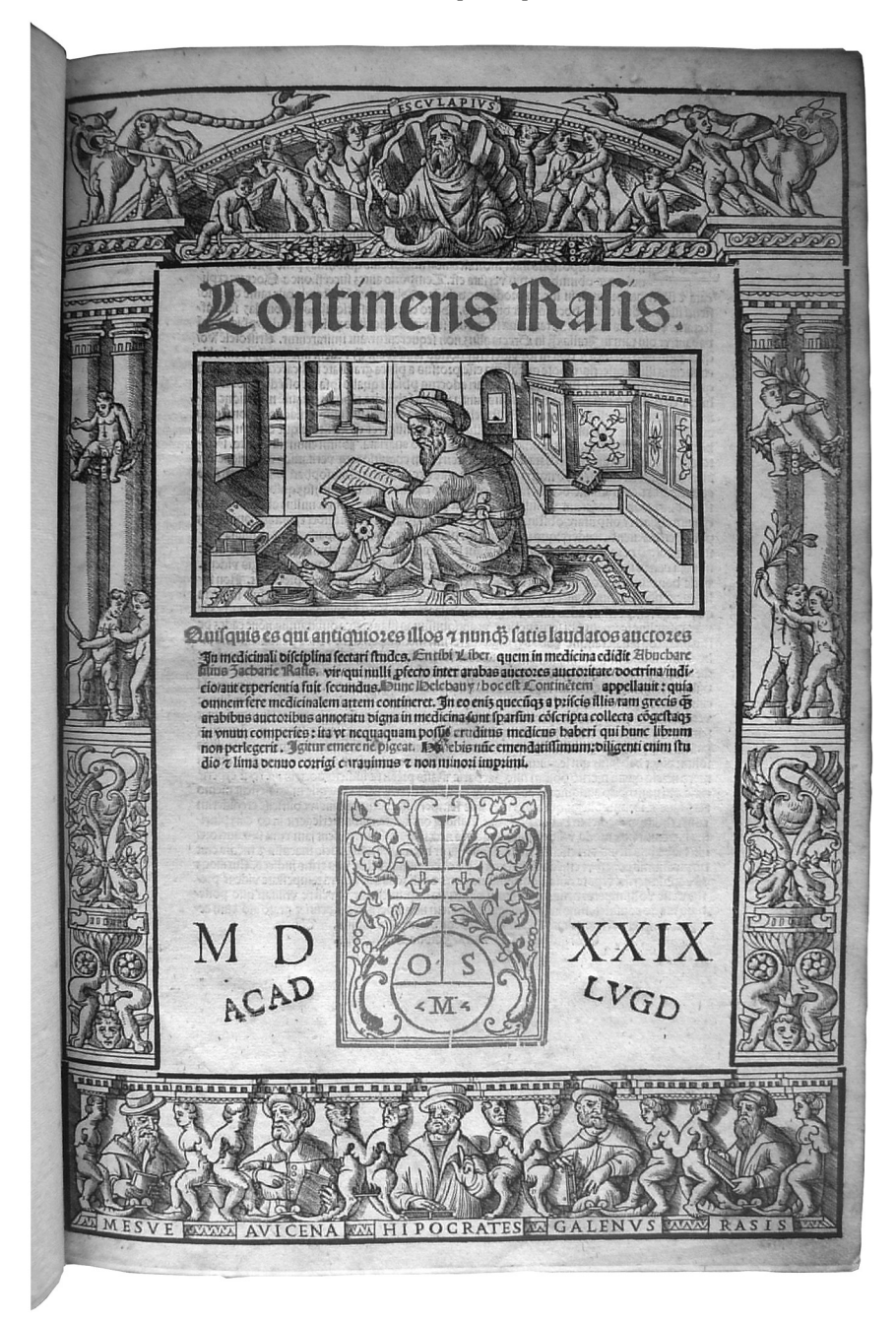
Figure 4 : Rhazes, Continens Rasis: quisquis es qui antiquiores..., 2 vols (Venice: Ottiovano Scoto, 1529), Vol. I, title page. Courtesy: Leiden University Library, obj. nr. 631 A 11-1.