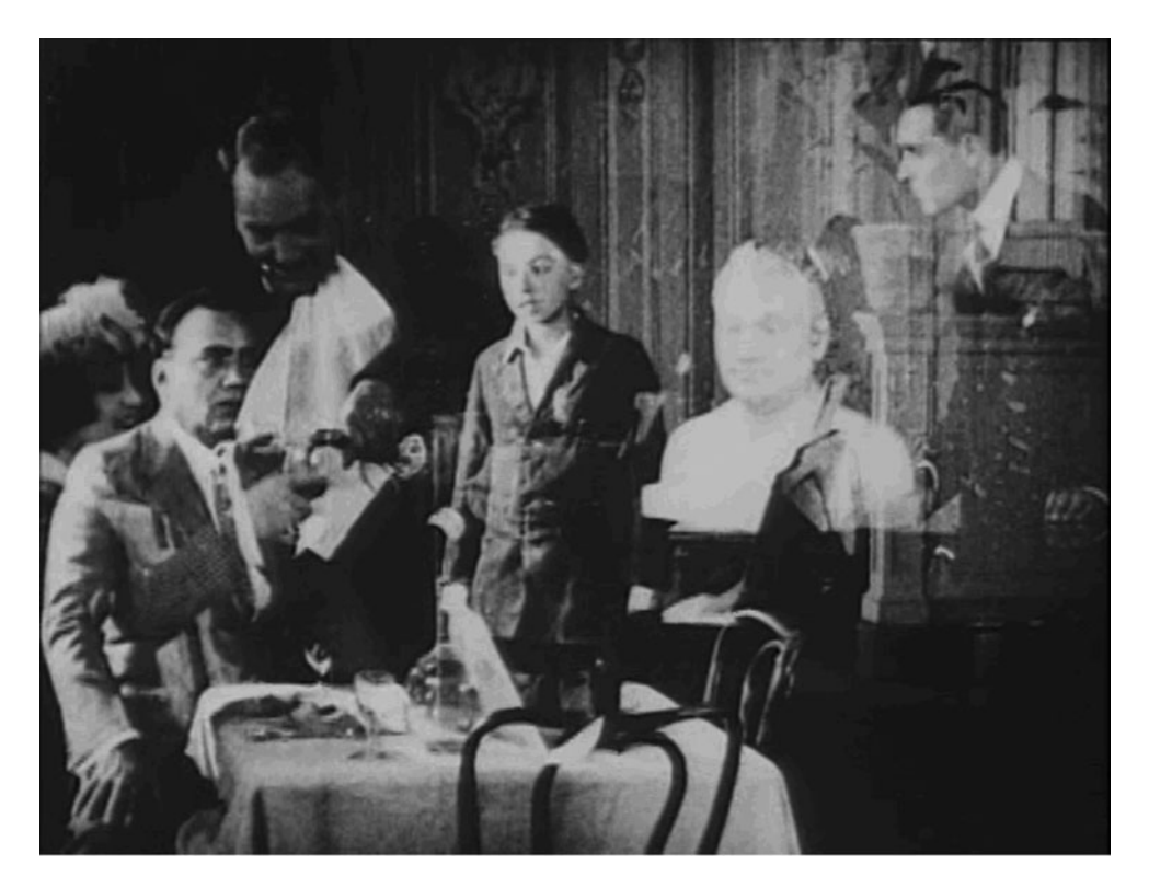
Figure 2. A still image from My Cousin (1918): this cross-fade shows Cesare Caroli (Caruso, seated) remembering meeting his cousin Tommaso (Caruso, standing) in a restaurant, but failing to recognise him. Tommaso's bust of Caroli also appears in this shot. The film is in the public domain; see <a href="https://commons.wikimedia.org/">https://commons.wikimedia.org/</a> (accessed 27 February 2020).

the United States. More than any other record, this disc has been marked out for its power to attract listeners to the gramophone: it was, or so we frequently read, the first ever to sell a million copies (to 'go platinum'). However, popular sources that repeat this claim – such as the Guinness Book of World Records – avoid mentioning when the millionth copy was sold. <sup>52</sup> Early accounts from the trade press, by contrast, present a looser affinity between Caruso and early disc listeners – such as when, in 1907, a Philadelphia-based gramophone salesman reported that his customers were requesting demonstrations from the tenor, although, he pointed out, not any song or disc in particular. <sup>53</sup> Recorded among the pages of Talking Machine World , this local snapshot warns against reading 'Vesti la giubba' as an instantly acclaimed hit. More likely, it accrued its devotees over time, as an eminently collectable