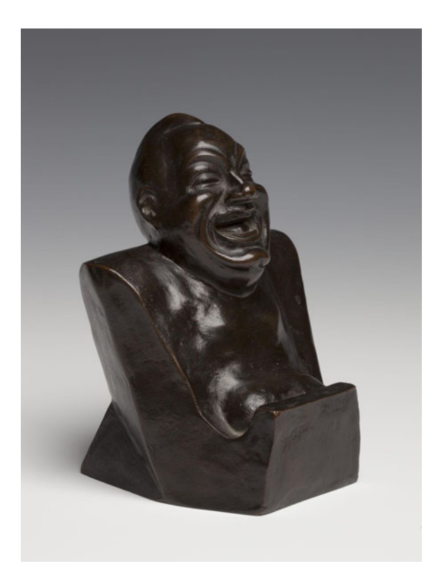
Figure 1. 'Caricature self-portrait bust by Enrico Caruso' (1909), sculpture in blackened bronze. Museum number S. 104–2015.

comes shortly after Cesare's performance at the Met and takes place in an Italian restaurant: Tommaso orders a round of drinks for everyone present and proposes a toast to the famous tenor. Cesare watches the scene with satisfaction from a private booth and then makes to leave: in an extend shot, he walks from the deep background towards the exit, passing Tommaso on the way. As they approach each other, Tommaso enjoins the stranger to raise a glass to Italy's beloved tenor, an offer that Cesare declines. Once the singer has left, the restaurant's owner reveals to all that they have been in the presence of the great Cesare Caroli, and Tommaso is crestfallen not to have recognised him. A second shot showing two Carusos – this time perhaps through a double rather than a trick shot – occurs near very the end of the film, enacting the long-delayed reunion between cousins.