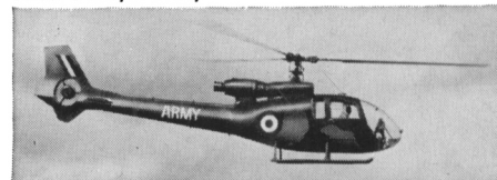
SA.341 British Army