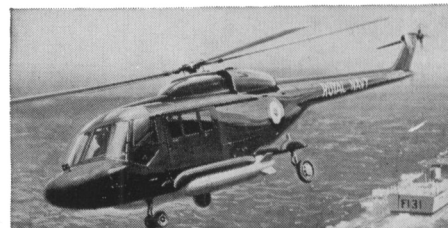
WG.13 Royal Navy