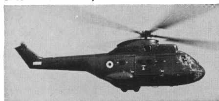
SA.330 French Army