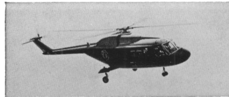
WG.13 French Navy