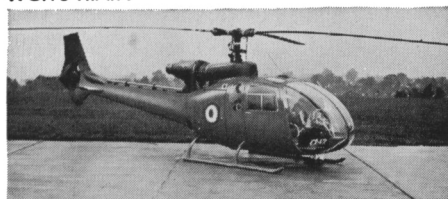
SA.341 French Army